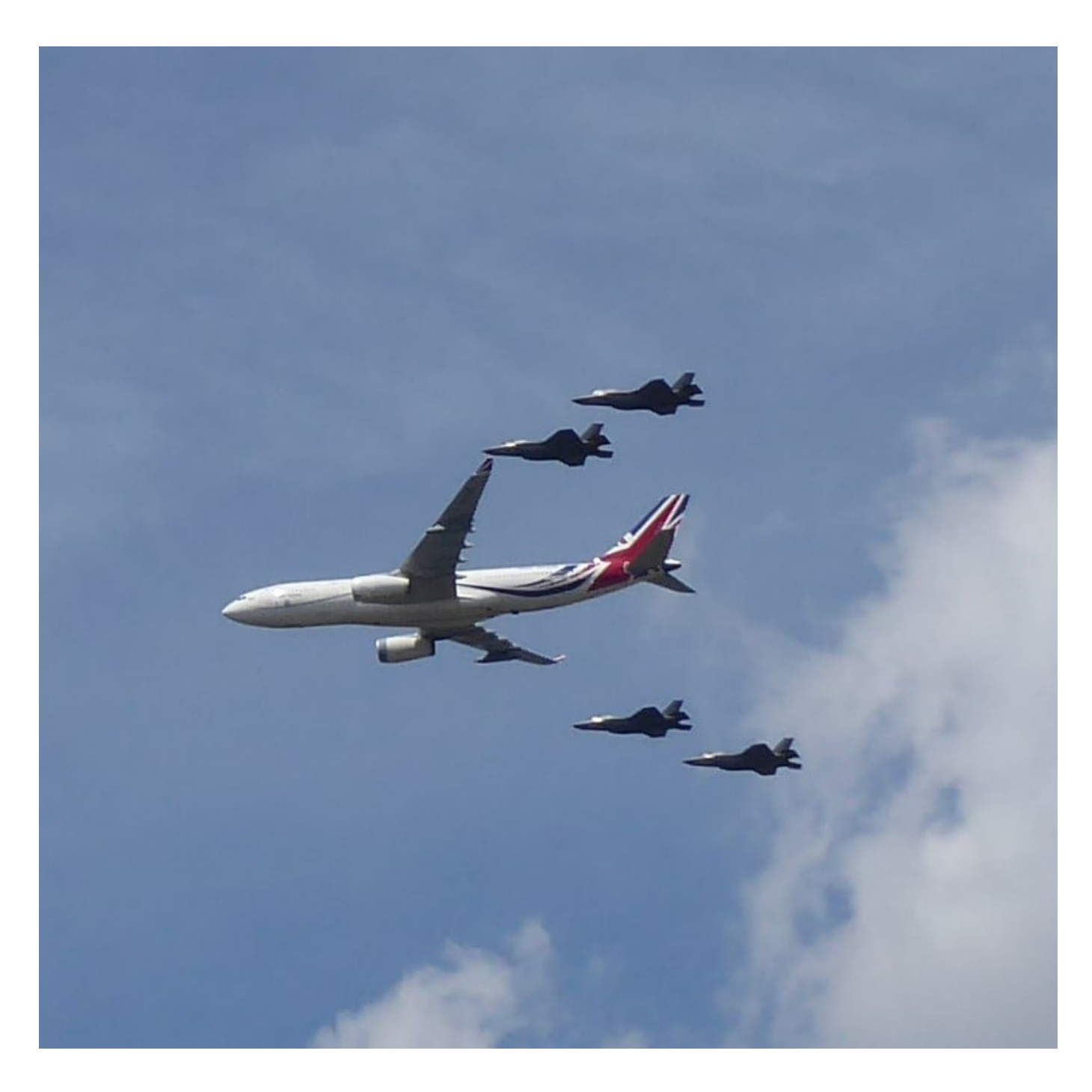
Wave 12 was 4 Hawks.

Then my prize photograph of the day, Wave 13. 15 Typhoons forming the number 70.