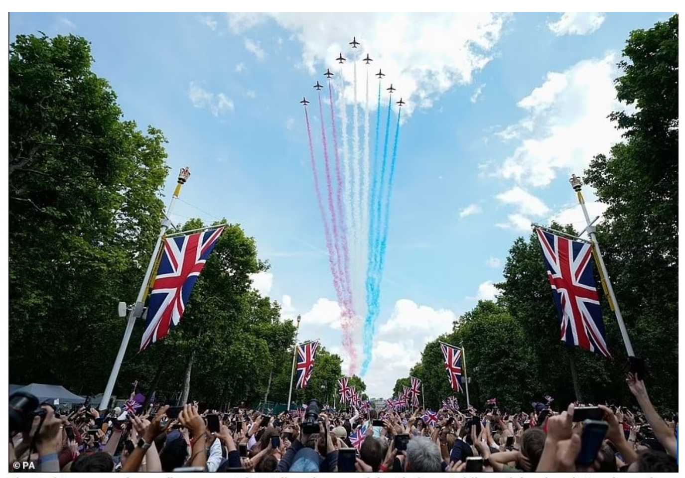
The Red Arrows perform a flypast over The Mall on day one of the Platinum Jubilee celebrations in London today

45 or so seconds flying time later, this is what they looked like over the Mall and the crowds. As I can't be in two paces at once I pinched this from the Daily Mail.