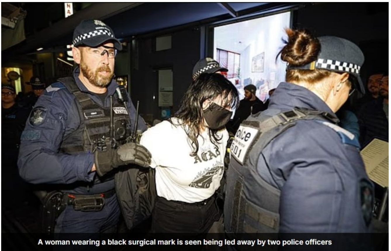
A woman wearing a black surgical mark is seen being led away by two police officers

When the masked protesters arrived at Miznon, diners can be heard screaming as furniture and tables are overturned.