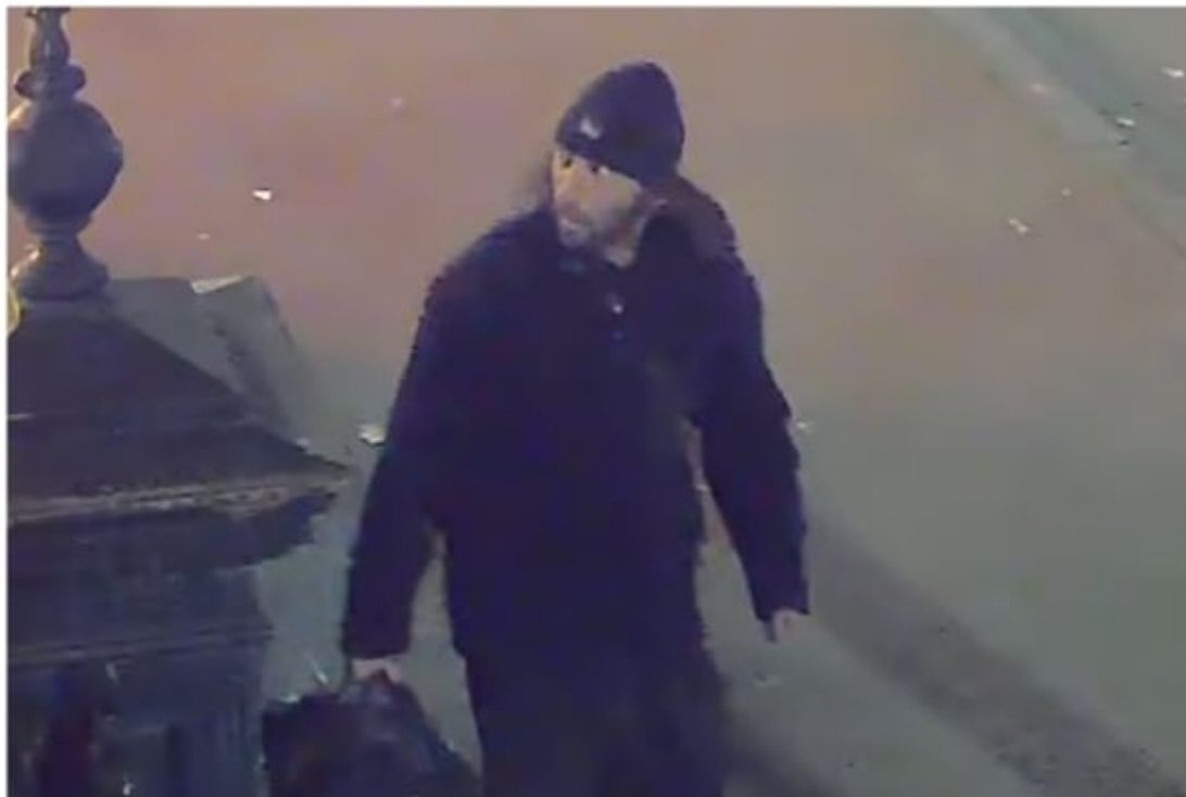
Victoria Police have released images of a person they wish to speak to about the synagogue arson attack.

'There is absolutely no place in our society for anti-Semitic or hate-based behaviour,' a police spokesperson said.