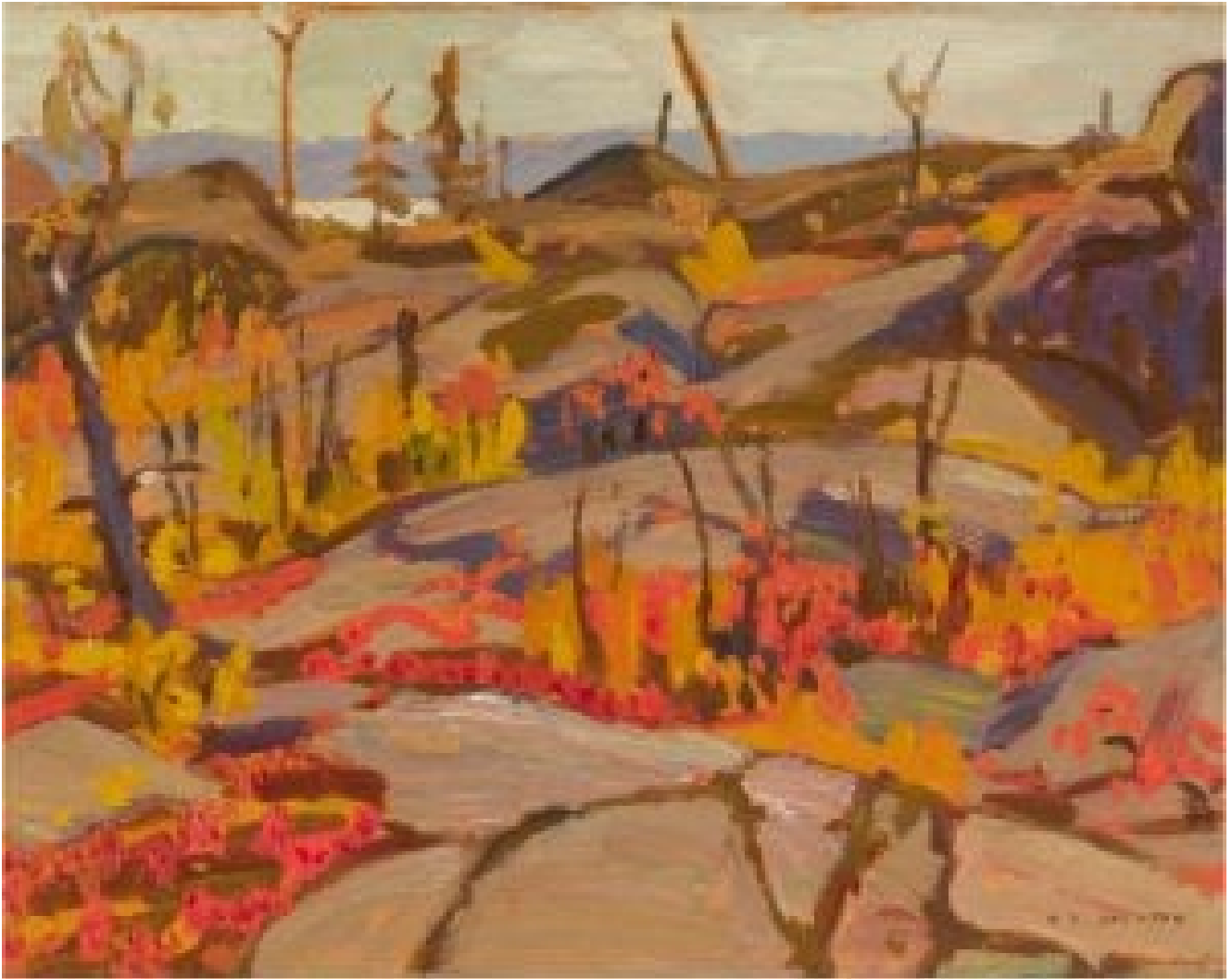
Wild Cherries and Huckleberries, Lake Superior , A. Y. Jackson, 1921

I'll be your huckleberry. –Doc Holiday to Johnny Ringo