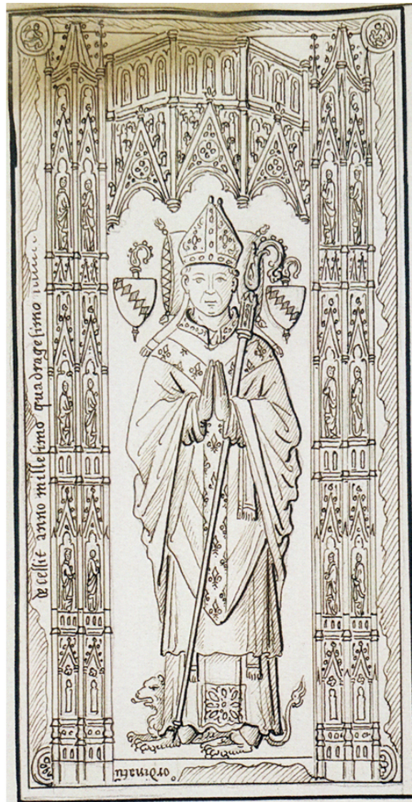
Fig. 4 & Fig. 5

In this staggeringly detailed and beautiful tome, the author has done more than record the design and details of incised effigial slabs, but has analysed their meanings, and why patrons were motivated into commissioning and erecting such artefacts. The subtitle of his book—‘to engrave well and truly’—is apposite, given the high æsthetic qualities of what were often finely crafted objects. Most, but not all, of the slabs in the inventories Cockerham has compiled, are illustrated by photographs of the monuments themselves or by printed or drawn images of them. As this reviewer well knows, ‘taking good pictures of monuments in churches is not easy’, for ‘slabs and tombs are frequently treated as part of the