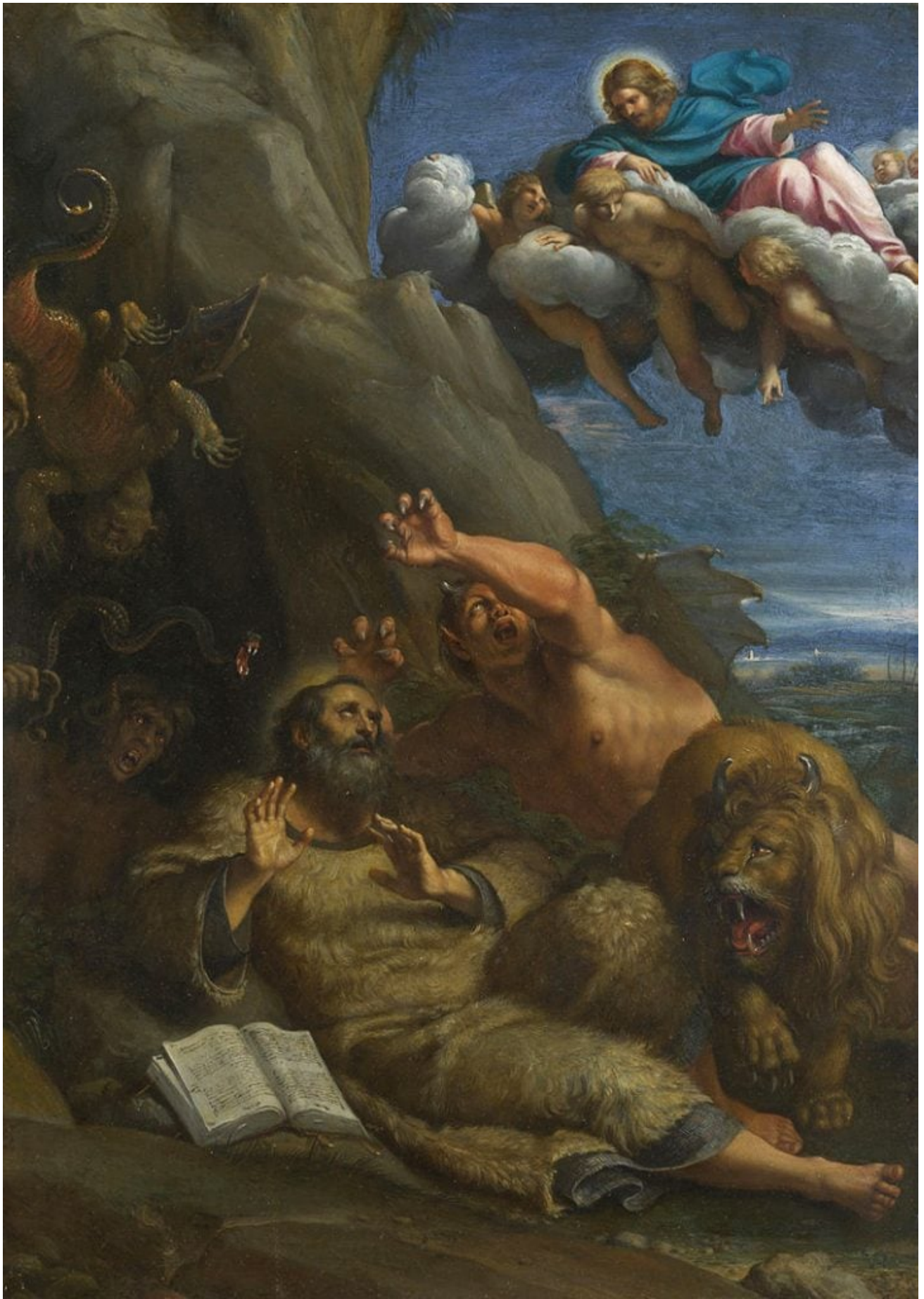
Christ Appearing to Saint Anthony Abbot, Annibale Carracci, 1598-1600