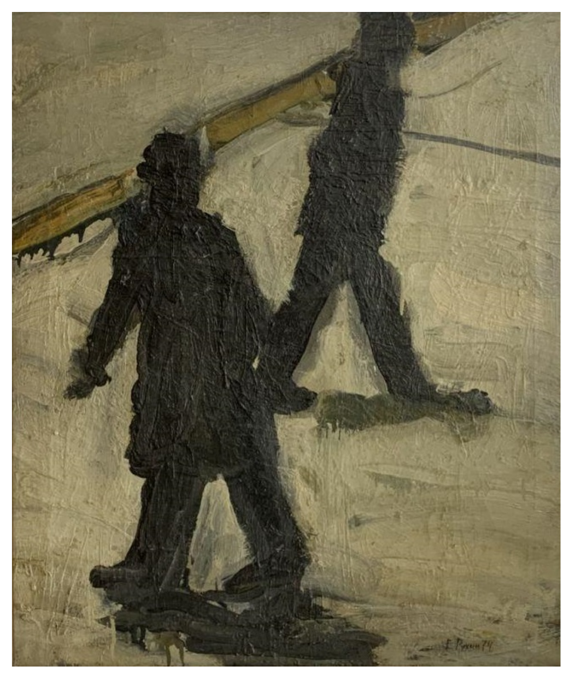
Untitled, Evgeny Roukhin, 1974

Walking on the Tahoe Rim trail on all but the most popular