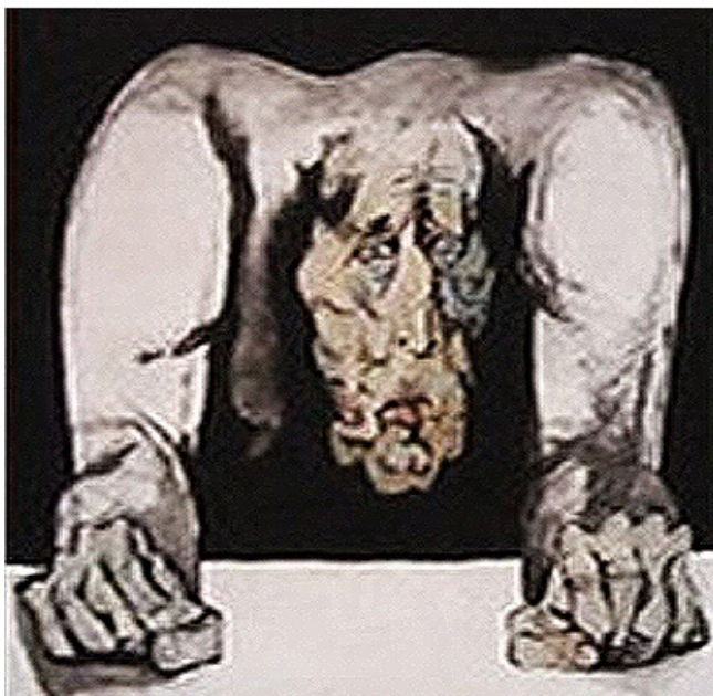
Reunión en el Pentágono , Oswaldo Guayasamín, 1970