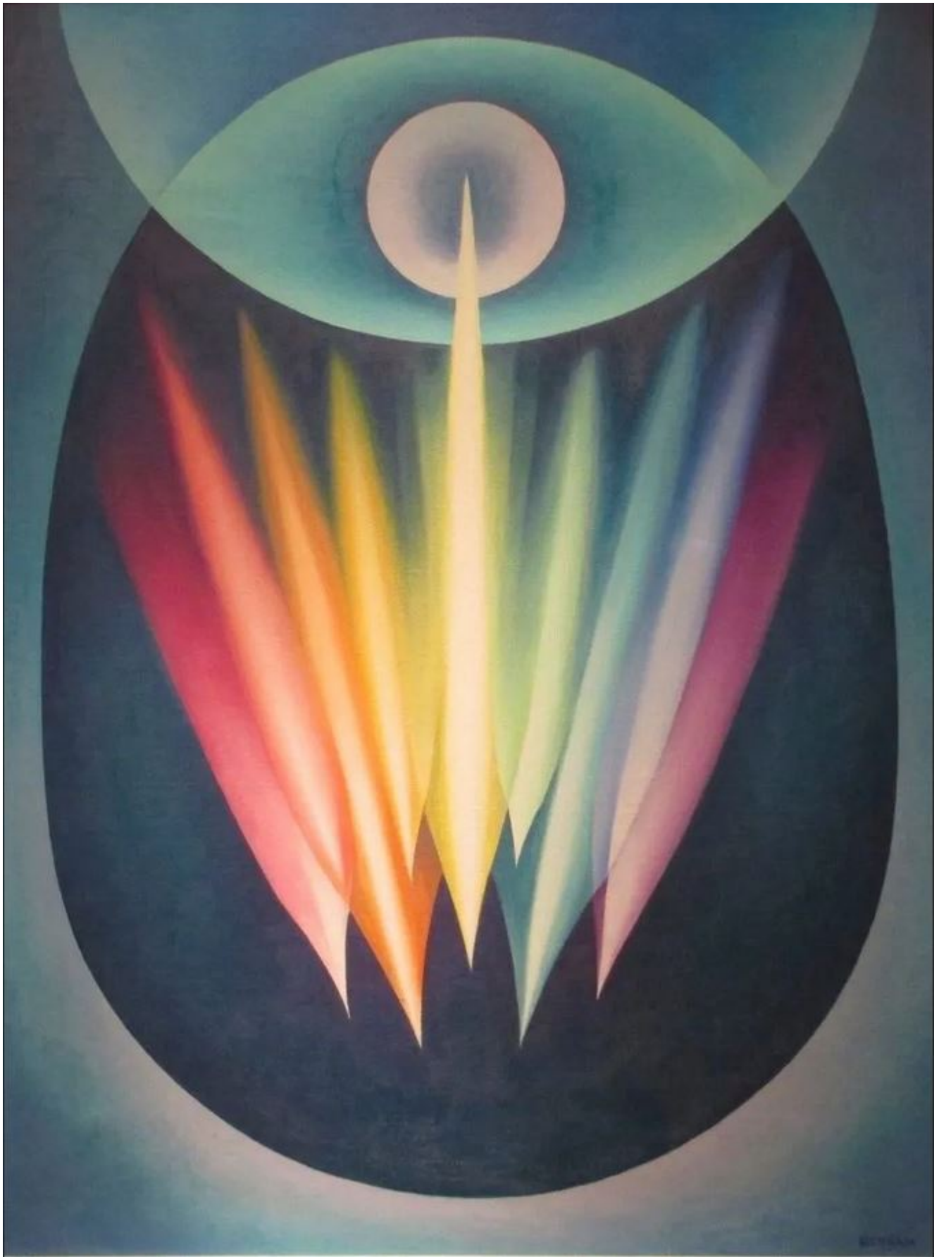
Cosmic Egg Series No. 1 (Creative Forces) , Emil Bisttram, 1936