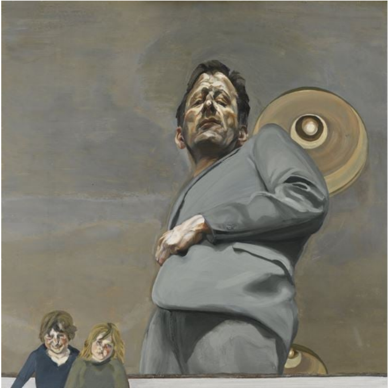
Reflection with Two Children [Self-Portrait] (Lucian Freud, 1965)

If persecution, liquidation and the other systems of social