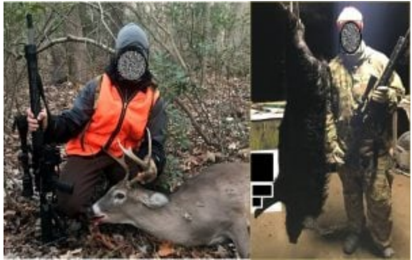
Acquaintances of the author with game killed using AR rifles.

Gun control advocates are at pains to lump the semiautomatic AR-15 in with its selective fire cousin, the M16 (a selective fire weapon can operate either as a semiautomatic or as a machinegun at the user's discretion), the implication being that if a weapon is useful on the battlefield, it must be especially dangerous in the hands of a criminal. Perhaps paradoxically, this is not the case. To see why, it is necessary to understand how infantry combat differs from violent crime.