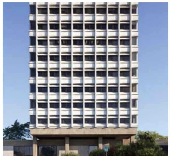
Tower East building, Shaker Heights, OH, 1966, Walter Gropius

All architecture since then, in apostolic (though also demoniac) succession to the founders, has failed to recover any sense of the human. One of the tenets of modernism was the abjuration of ornament, though until its advent ornamentation in architecture had been universal, albeit very changeable—and gloriously so, only the modernists had the idea of imposing themselves and their style upon the whole world.