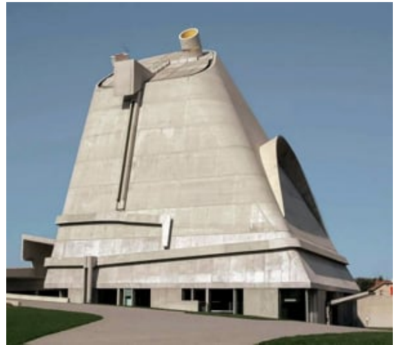
Church at Firminy, France, 1963, Le Corbusier

It is not worth puzzling long over this.