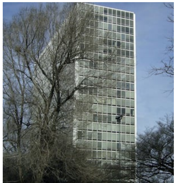
Lafayette Towers West, Detroit, MI, 1963, Ludwig Mies van der Rohe

However, architects grew tired of the dictates of the zeitgeist à la Corbusier and have since sought absolute liberty to do whatever they choose, as free artists completely untrammelled by what has gone before or by the surroundings of what they build. Harmony even became a dirty word for them. Originality was their holy grail, the unthought of and the unthinkable being their highest aim. At least they chose an ambition easy of achievement: nothing is easier than originality divorced from any other quality.