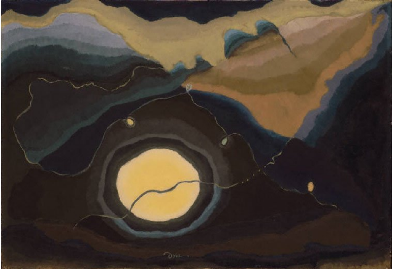
Me and the Moon , Arthur Dove, 1937