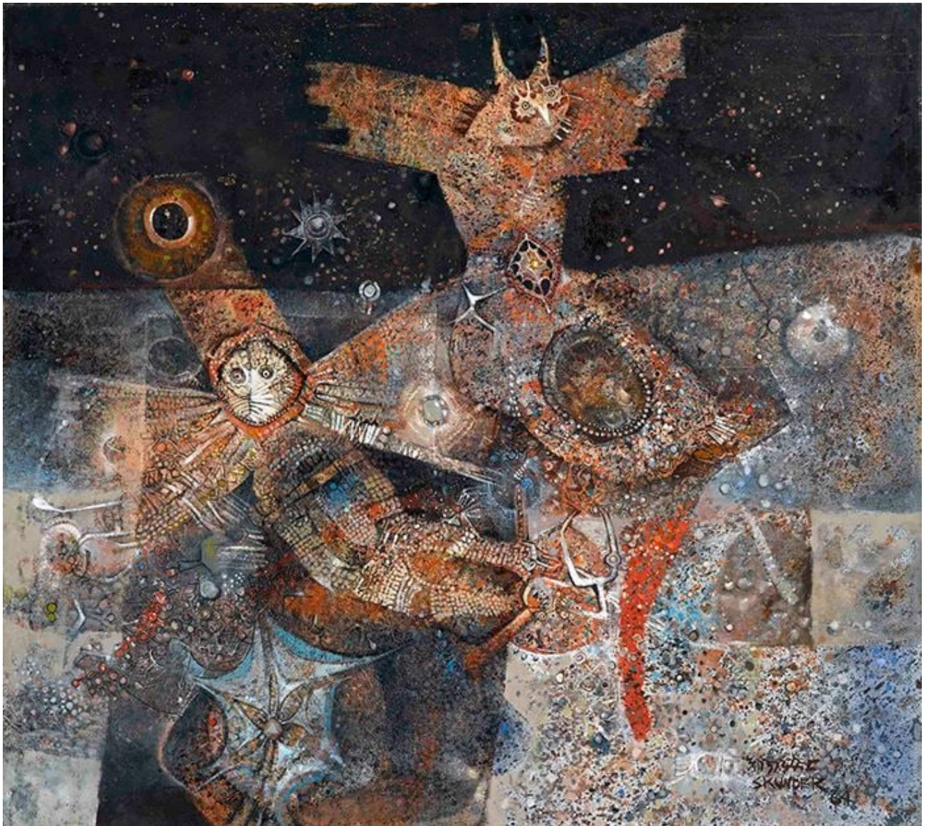
Night Flight of Dread and Delight , Skunder (Alexander) Boghossian, 1964