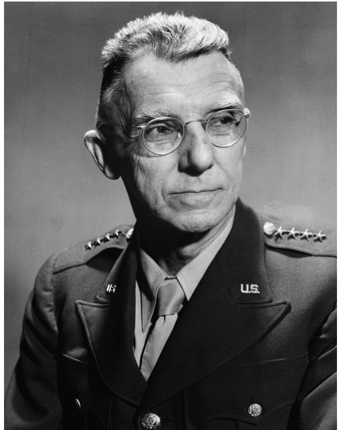
Vinegar Joe Stillwell

The former peace party is now the Pentagon war party. We are now beyond irony.