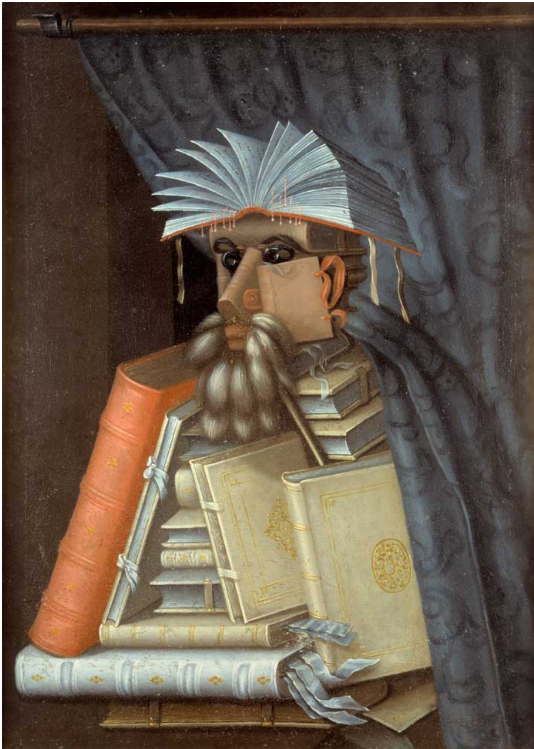
The Librarian , Giuseppe Arcimboldo, 1566

Propaganda does not deceive people; it merely helps them to deceive themselves.