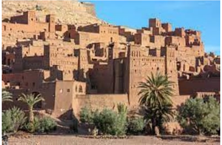
The oasis of Ait Benhaddou

evaporates and the oasis becomes an island of green among brown hills and the nearby desert that beckons on the horizon.