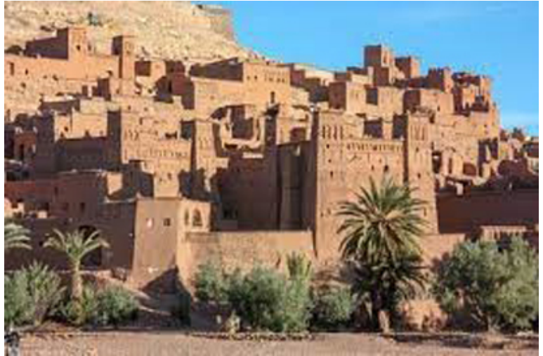
The oasis of Ait Benhaddou

evaporates and the oasis becomes an island of green among brown hills and the nearby desert that beckons on the horizon.