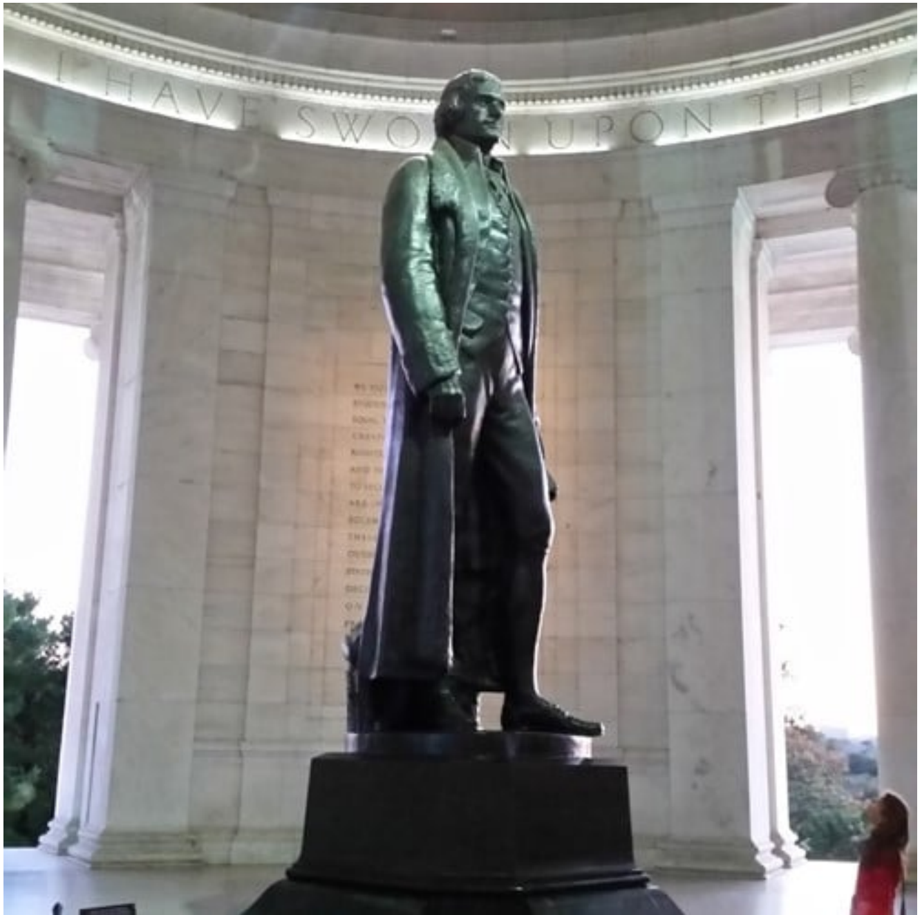
Jefferson Memorial, Washington, DC