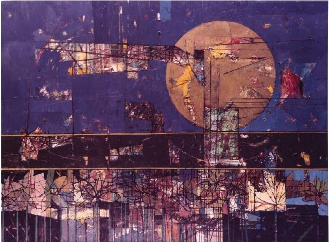
Moon, Horizon, and Flowers (Rocket Rollout) , Jack Perlmutter, 1969

If you look up at the moon tonight, understand that you are not looking at a primordial rock that has orbited above our heads, rearing its pale, pockmarked face every night, since the dawn of humanity. Instead, you are looking at a treasure trove of natural resources. As you stare up at the pale,