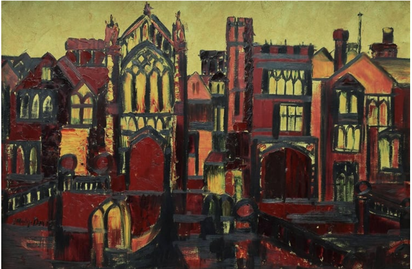
Selwyn College, Cambridge

The university has always been the site of contested visions. But ever since, say, the 1987 publication of Alan Bloom's The Closing of the American Mind , myriad critics from across the political spectrum have been raising alarm bells about the erosion of liberal learning in the academy, a task that has historically been at the very heart of the university's mission.