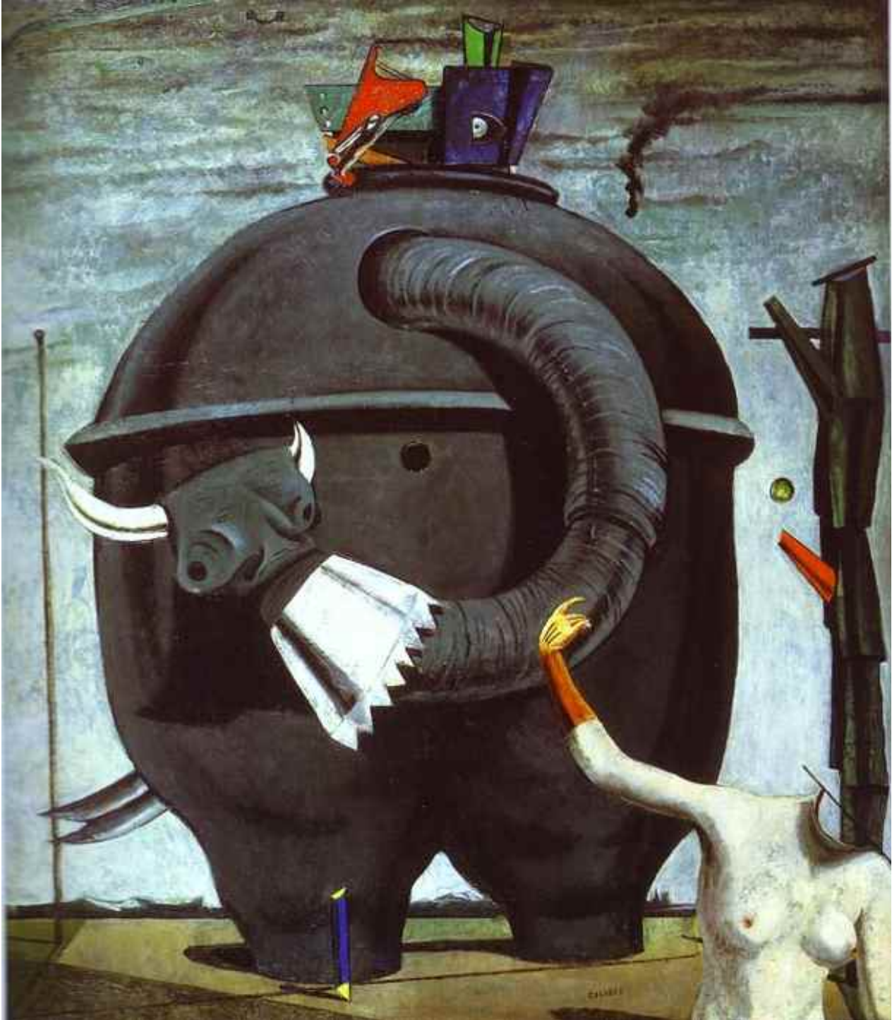
The Elephant Celebes (Max Ernst, 1921)

The significance of the passage of time, right? The