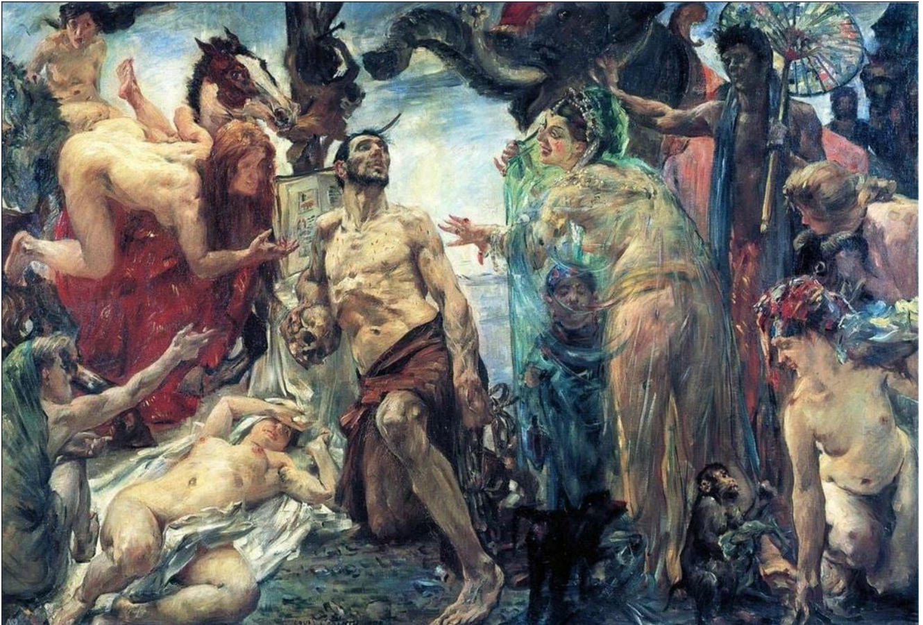
The Temptation of Saint Anthony [after Gustave Flaubert] (Lovis Corinth, 1908)

By night, Flaubert did some of his best writing, to “crown the day’s work.” Flaubert’s correspondence sheds as much light on his creative process as it does on 19 th -century French art, literature and politics.