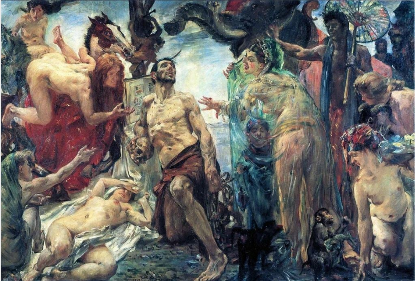
The Temptation of Saint Anthony [after Gustave Flaubert] (Lovis Corinth, 1908)

By night, Flaubert did some of his best writing, to “crown the day’s work.” Flaubert’s correspondence sheds as much light on his creative process as it does on 19 th -century French art, literature and politics.