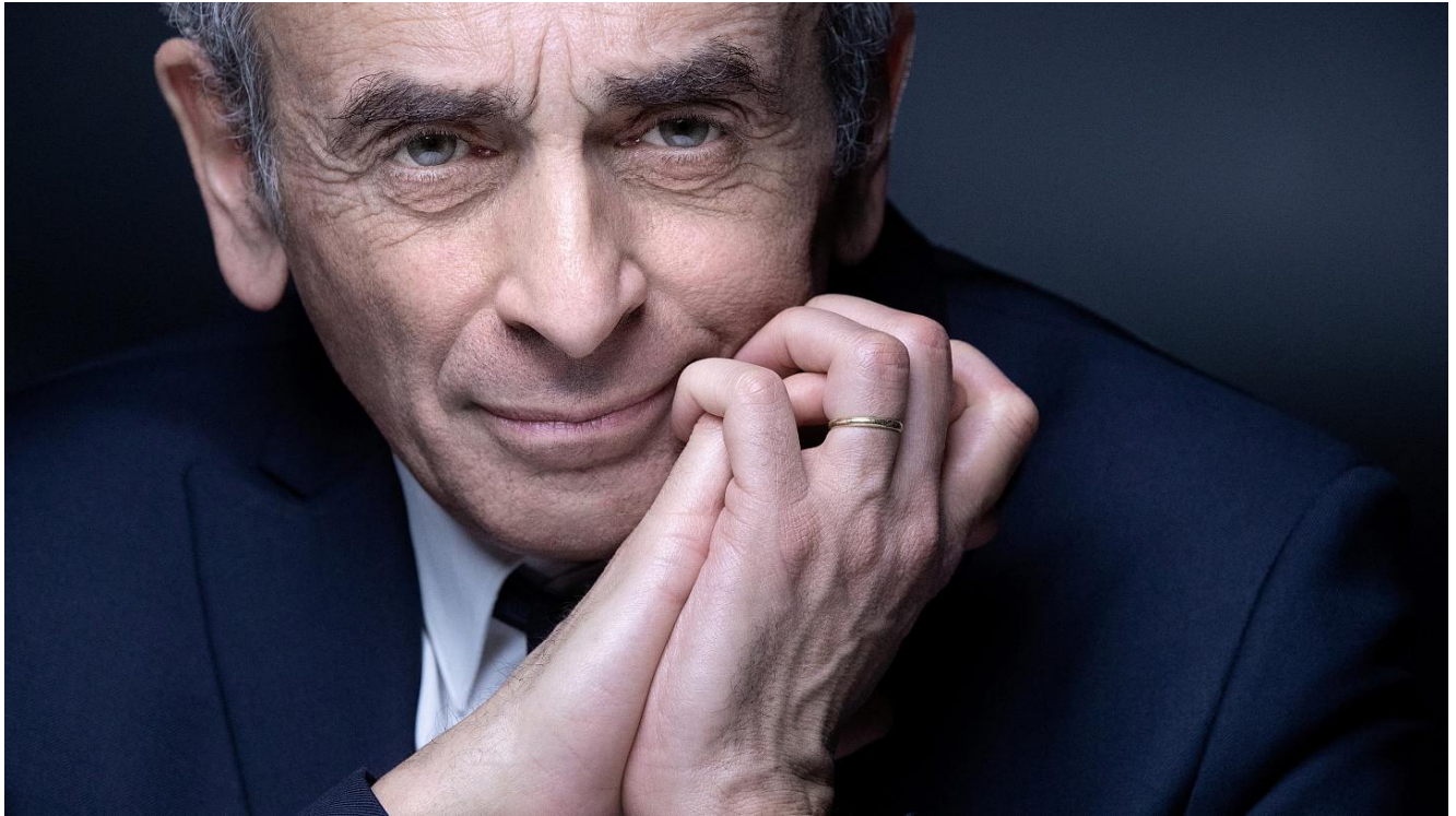
Eric Zemmour

France's Jewish community—Europe's largest —is confronting the rise of Eric Zemmour, a columnist, TV personality, bestselling author, and undeclared candidate in the April 2022 French Presidential elections. Paris-born son of Algerian-Jewish-Berber background whose parents came to mainland France in 1952, he trades in controversial assertions that have caught a wave of enthusiastic support: The “Grand Replacement,” the replacement of French culture and civilization by an immigrant Muslim population; that Maréchal Pétain saved French Jews by sacrificing foreign Jews; that Captain Dreyfus was more German than French, and others. Zemmour's insensitive comments about the burial in Israel of several French-Jewish victims of antisemitic murders was a low point in a flow of ambiguous statements condemned by the President of the French Jewish