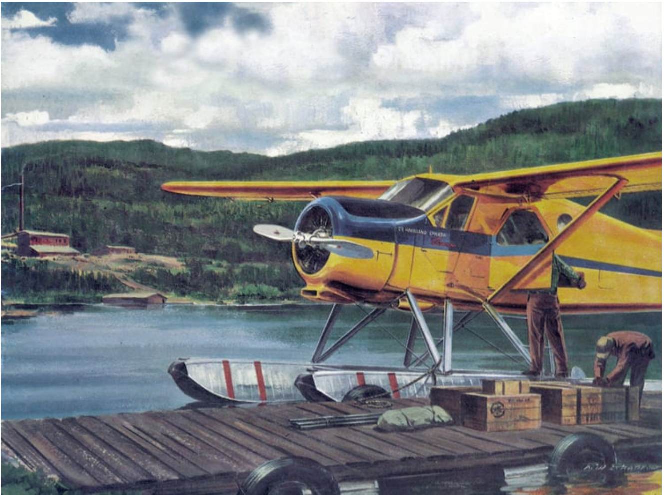
De Havilland DHC-2 Beaver brochure cover

Flez just couldn't believe there was that much wickedness in this big, beautiful, coloured postcard of a world.—Gavin Lyall, Midnight Plus One