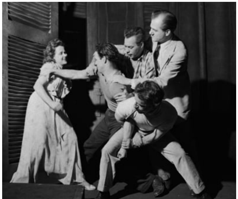
Kim Hunter, Marlon Brando, Karl Malden, and others