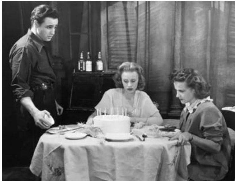
Marlon Brando, Jessica Tandy, and Kim Hunter

It was now a month before rehearsals started—and still no Stanley Kowalski.