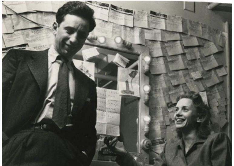
Elia Kazan and Jessica Tandy

The next order of business was lining up a director. Tennessee Williams had recently seen Arthur Miller's play "All My Sons," which was directed by Elia Kazan and he decided that's the guy for us. Williams wrote Kazan a letter praising his skills and Irene sent him the script. He said no. Kazan was one of the New Yorkers who had sneered at the very idea of Irene Selznick producing anything. And he was also ticked off that he wasn't the only director Irene was talking to. That kind of thing might be standard practice out in the hinterlands of Hollywood, but as far as Kazan was concerned, that's not how we do things in the legitimate theatre.