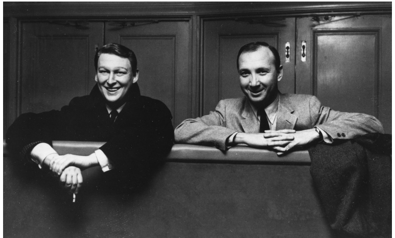
Mike Nichols and Neil Simon

Ellis and Hammerstein gave Simon six months for more rewrites—and they'd pay him the $300. Grateful to have feedback from a live audience, Simon set to work yet again.