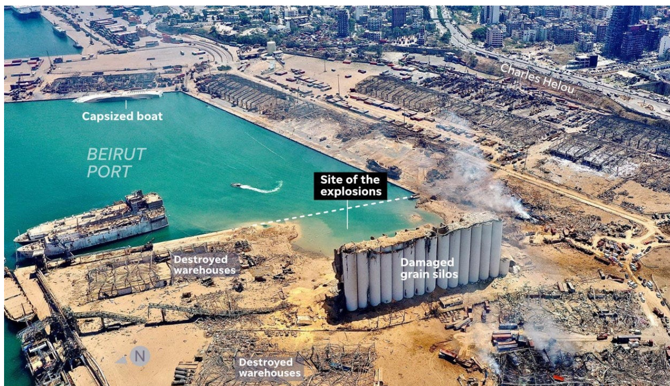
Beirut Port Damage