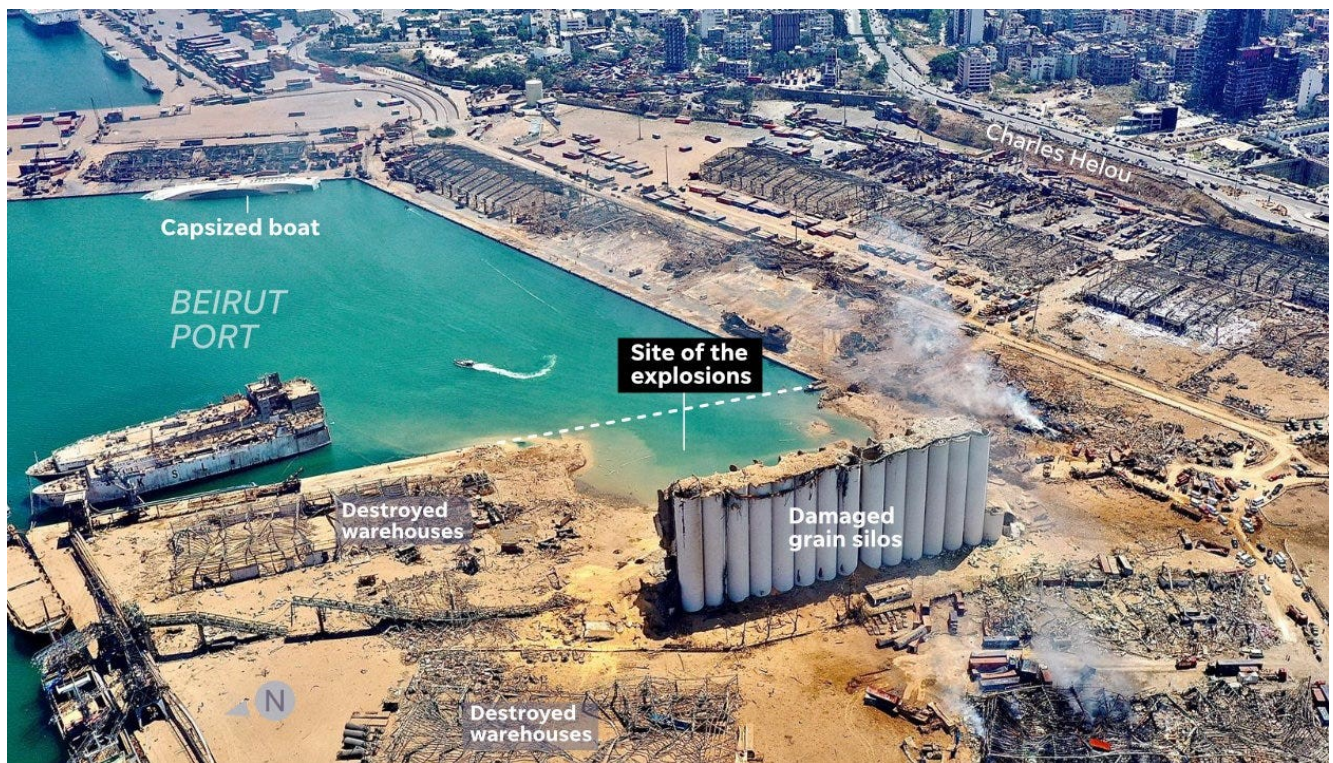
Beirut Port Damage