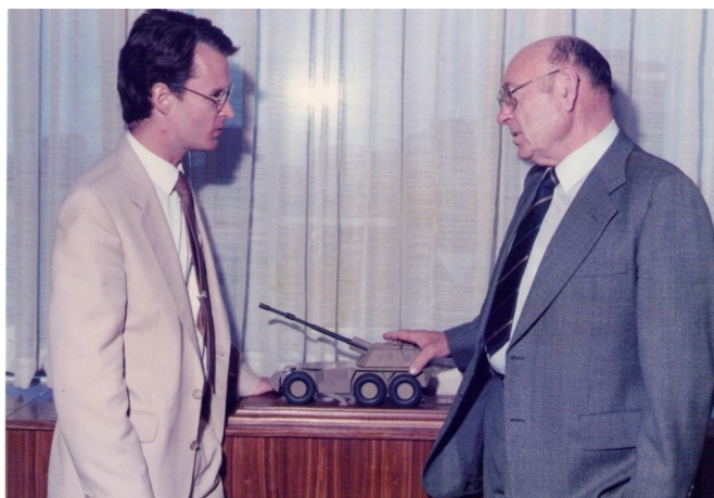
With ARMSCOR Head Piet Marais, South Africa, 1985

to the South Africans. They made the G5 gun and the G6, which is a wheeled version of it. I was down there for three weeks, at the invitation of ARMSCOR, the Armaments Corporation of South Africa, to do a defense magazine spread on the South African defense industry. They wanted to show it off. They had been embargoed for years, and they wanted to show that the embargoes had not only not slowed them down, but it had enhanced their modernization.