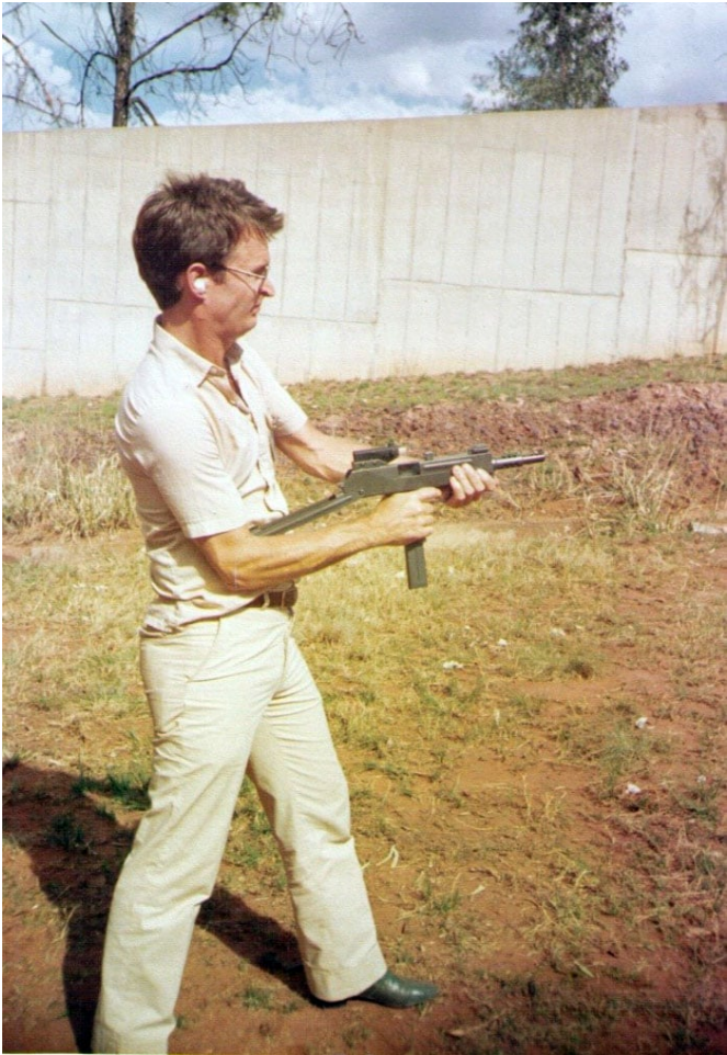
In South Africa, 1985

Because you cannot just throw a missile on an aircraft and expect it to work. There is the whole electronic interface. To be able to do the electronic interface, and the firing mechanism, and the radar interface basically you have to know everything about the missile, and you have to know everything about the aircraft. The Iraqis did not know anything about either. Clearly, they had Soviet technicians who were working on French NATO standard aircraft. This was a huge, huge deal because it basically gave the Soviets, at the height of the Cold War, access to some of our most secret targeting mechanisms, because, also under that wing, was the targeting pod, the laser designation pod. Well, the French said it was made by Thompson-CSF. They said, "Oh yes Thompson has sold this." It was not. Martin Marietta in the United States of America made it.