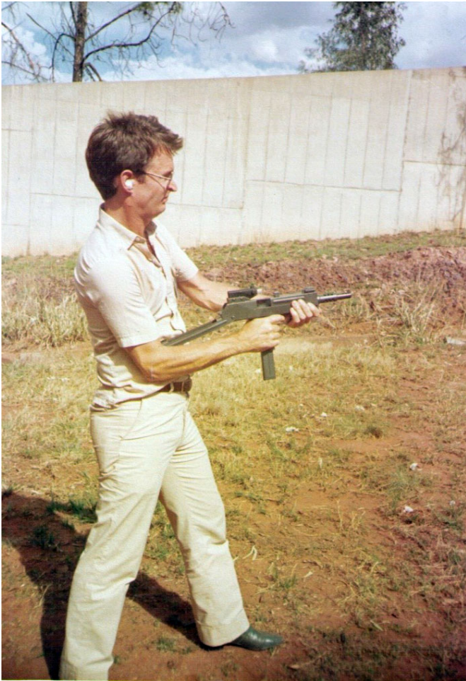
In South Africa, 1985

Because you cannot just throw a missile on an aircraft and expect it to work. There is the whole electronic interface. To be able to do the electronic interface, and the firing mechanism, and the radar interface basically you have to know everything about the missile, and you have to know everything about the aircraft. The Iraqis did not know anything about either. Clearly, they had Soviet technicians who were working on French NATO standard aircraft. This was a huge, huge deal because it basically gave the Soviets, at the height of the Cold War, access to some of our most secret targeting mechanisms, because, also under that wing, was the targeting pod, the laser designation pod. Well, the French said it was made by Thompson-CSF. They said, "Oh yes Thompson has sold this." It was not. Martin Marietta in the United States of America made it.