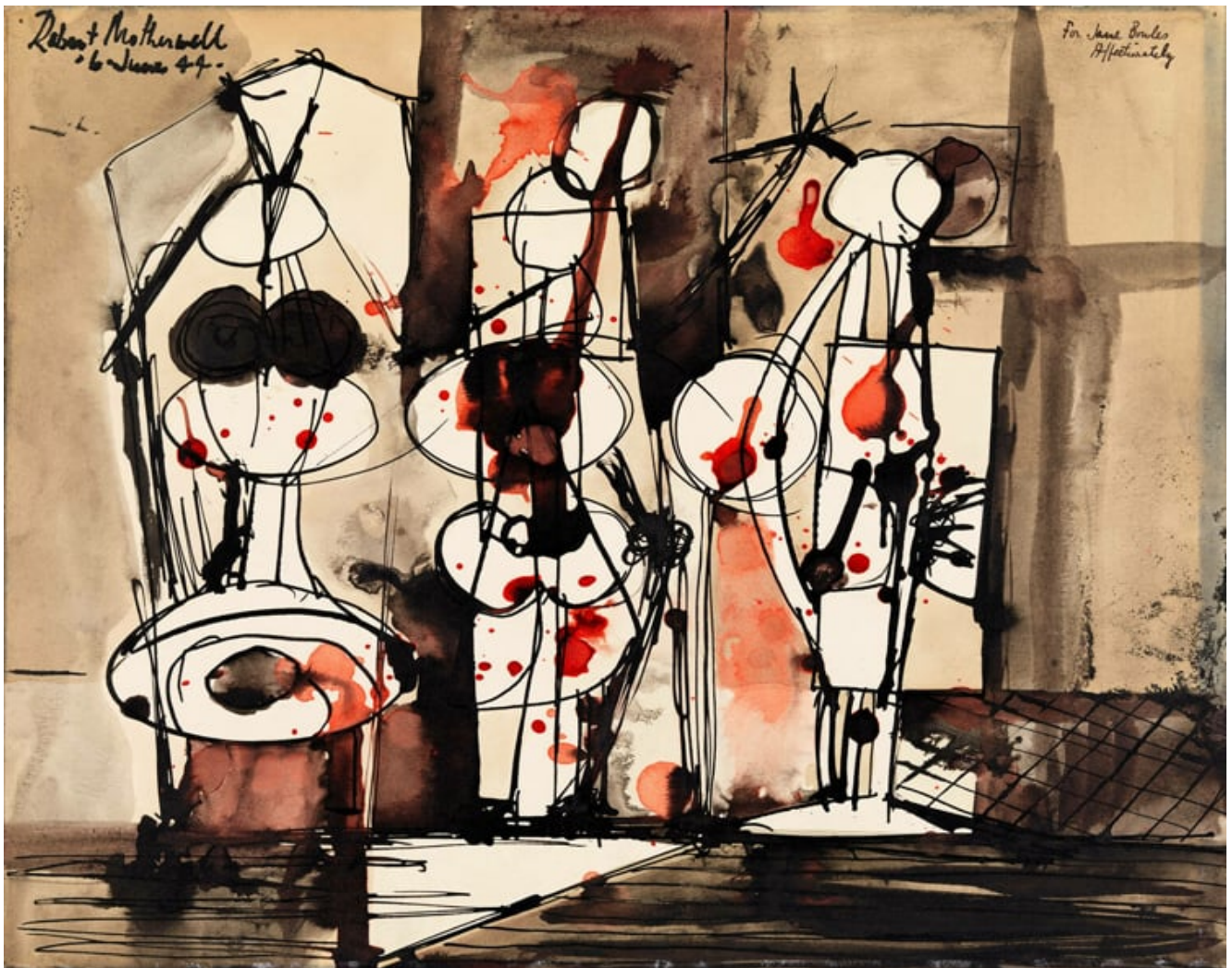
Three Figures Shot , Robert Motherwell, 1944

The role of cinema in shaping attitudes and perceptions