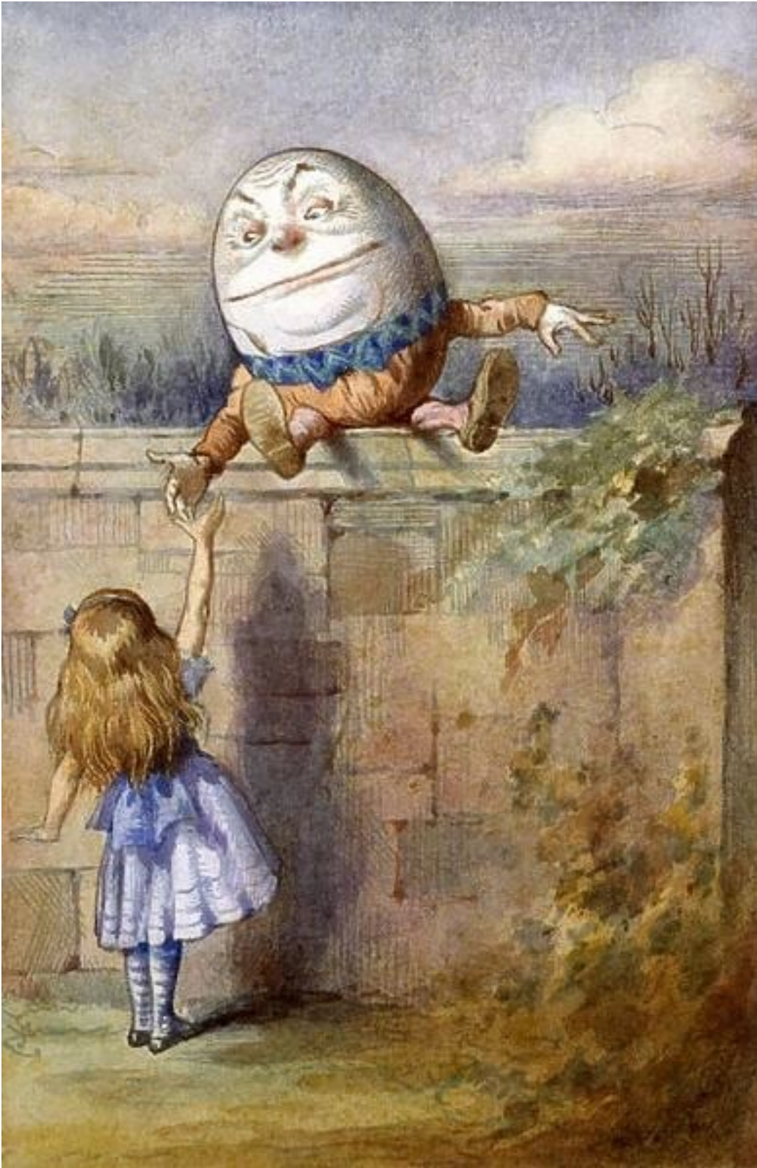
Humpty Dumpty, from Alice's Adventures in Wonderland and Through the Looking-Glass and What Alice Found There (John Tenniel, 1911)

Notions given satirical airing in Lewis Carroll's Alice