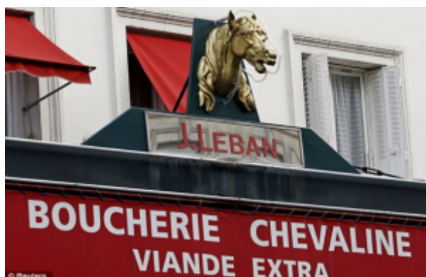
Image above French butcher shop

Curiously, Islamic law did not follow Judaism with regard to horses or camels but accepted the Old Testament prohibition on eating pork. According to Muslim scholars eating horses is not forbidden ( haram ) but is better avoided ( makrooh ).