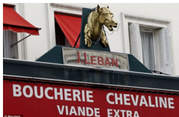
Image above French butcher shop

Curiously, Islamic law did not follow Judaism with regard to horses or camels but accepted the Old Testament prohibition on eating pork. According to Muslim scholars eating horses is not forbidden ( haram ) but is better avoided ( makrooh ).