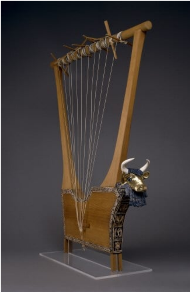
Royal Harp from Ur of the Chaldees, birthplace of Abraham

In the archaeological excavations carried out in the royal tombs of Ur, in Mesopotamia, beautiful ancient harps, covered with gold leaf have been brought to light after having been buried for thousands of years.