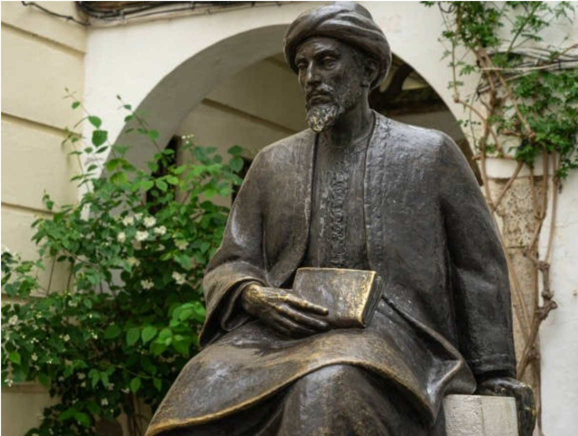
Statue of Rabbi Moses Maimonides in his birthplace, Cordoba, Spain

If you travel from the port of Haifa up into the hills you will inevitably come across the Bahai Temple, a splendid neo-Islamic structure with magnificent gardens open to the public. Standing on the marble steps of the shrine of the founder of this religion you look out at the port and the endless horizon of the Mediterranean Sea.