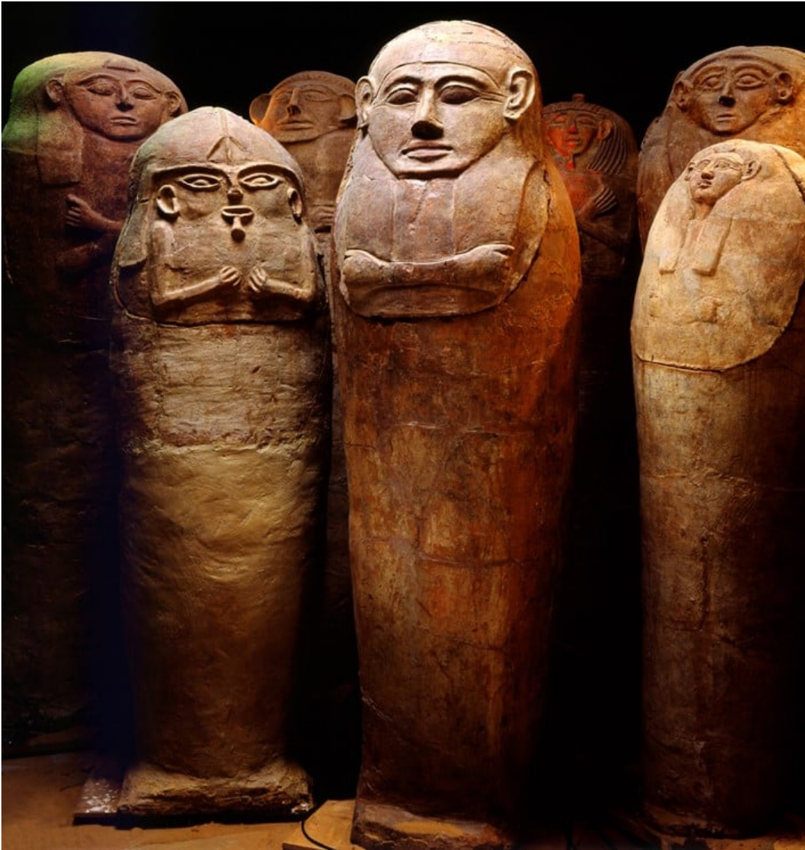
Ancient Canaanite Sarcophagi

Almost every Jew, and most Bible readers for that matter, sympathize with the Israelites and see the Canaanites as sophisticated, hierarchical, unfair, polytheistic and at worse, worshippers of Moloch and rooted to the 'Baal' or idol of their hill or city.