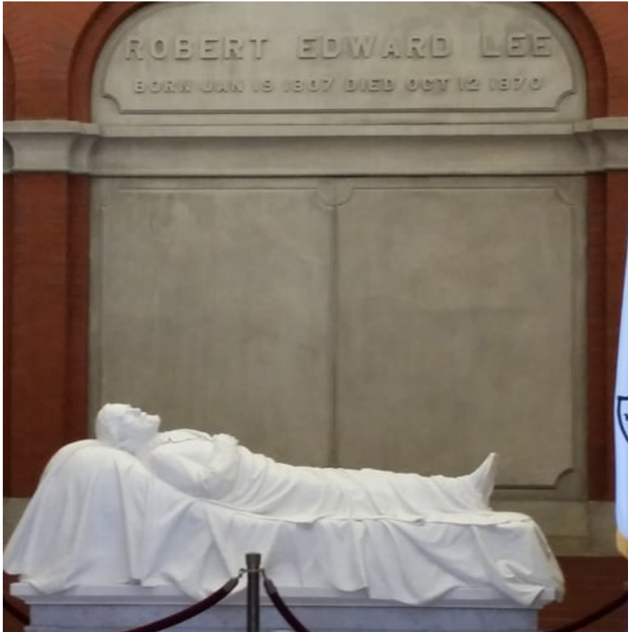
Recumbent Robert E. Lee, Lee Chapel, Washington and Lee University

something like this: we are caretakers of the present and the past and we will pass down to our descendants the painful lessons learned, the stories of sacrifice, courage, and character; we will protect our history and our heroes so that they remain forever as an inspiration for us, our children, and for the world.