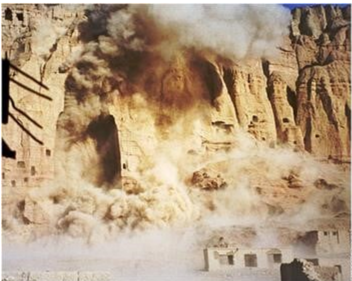
Destruction of the Bamiyan Buddhas by the Taliban, Afghanistan.

There is no consideration of honor to the past or obligation to the future among the people who destroy our history—it is nothing short of the tyranny of the living. Destruction of the past is an act of theft and thoughtlessness against the future, and worse.