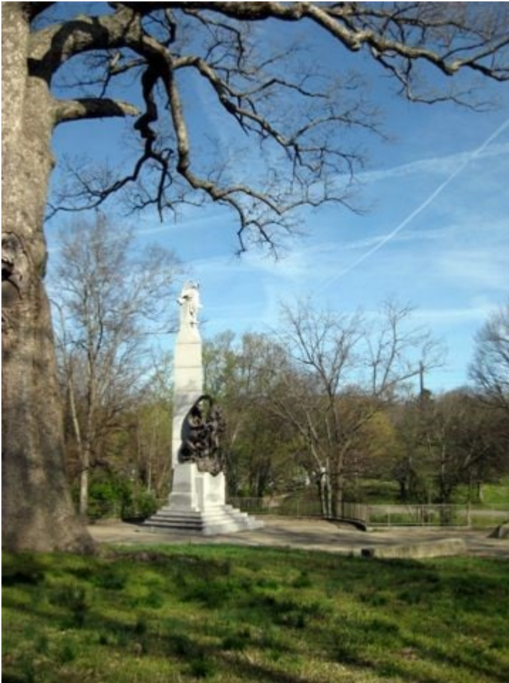
Battle of Nashville Peace Monument ( source )