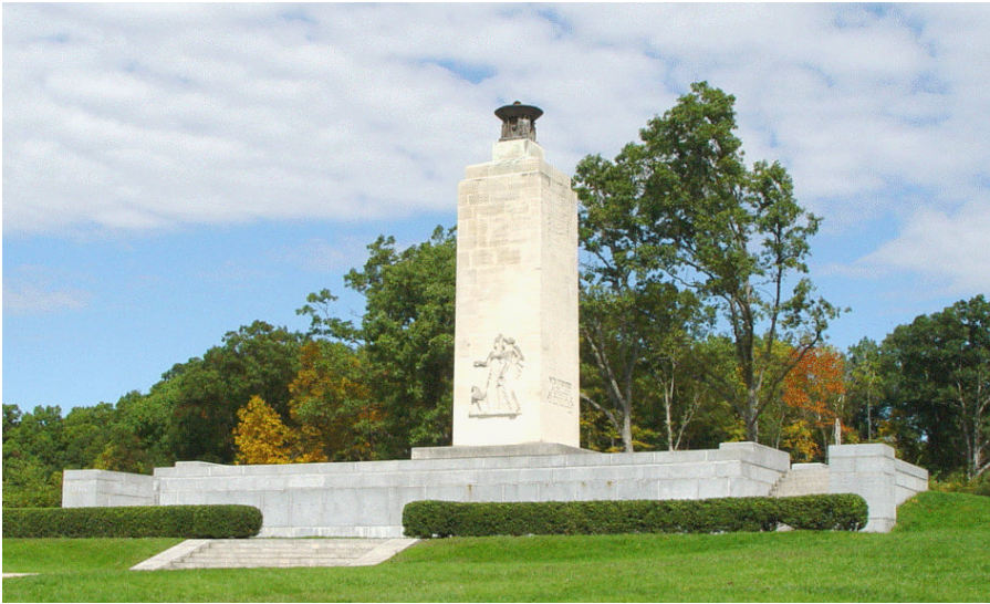
Gettysburg Peace Memorial

A country without heroes, a country that cannot accept its own greatness built upon tragedy, sacrifice, courage and compassion, and the painful lessons they learned for us; a country that cannot fulfill its promise of lasting appreciation and remembrance to its history and its heroes is a country falling.