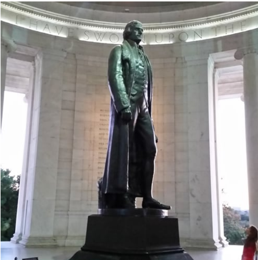
Jefferson Memorial

What will happen when the mob marches to Mount Vernon and stands before Washington's home screaming, burn it down!