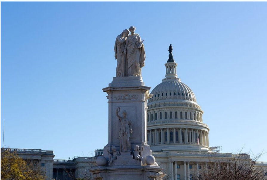
Peace Monument/Civil War Sailor Monument , Washington, DC