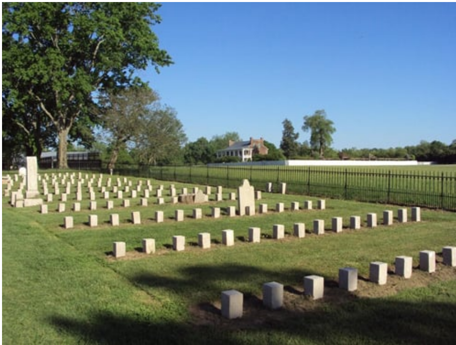
Confederate Cemetery, Carnton, Battle of Franklin, Tennessee ( source )