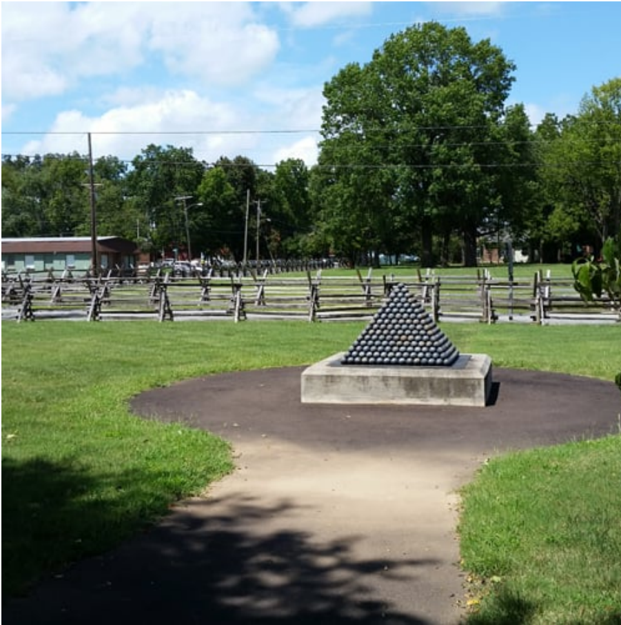
Death site of General Patrick Cleburne, Battle of Franklin, Tennessee

The decoupling of the living generation from the past, the abandonment of all obligations to the past, to history and to the truth of what history is and means, is at the foundation of the failure of the Jacobins during the French Revolution. When the living feel no obligations to the past, the nation is adrift in dangerous waters.