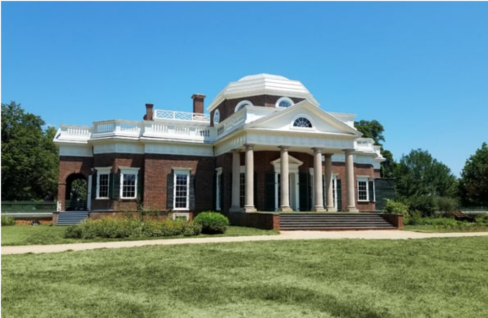
Monticello (Kendra Mallock)