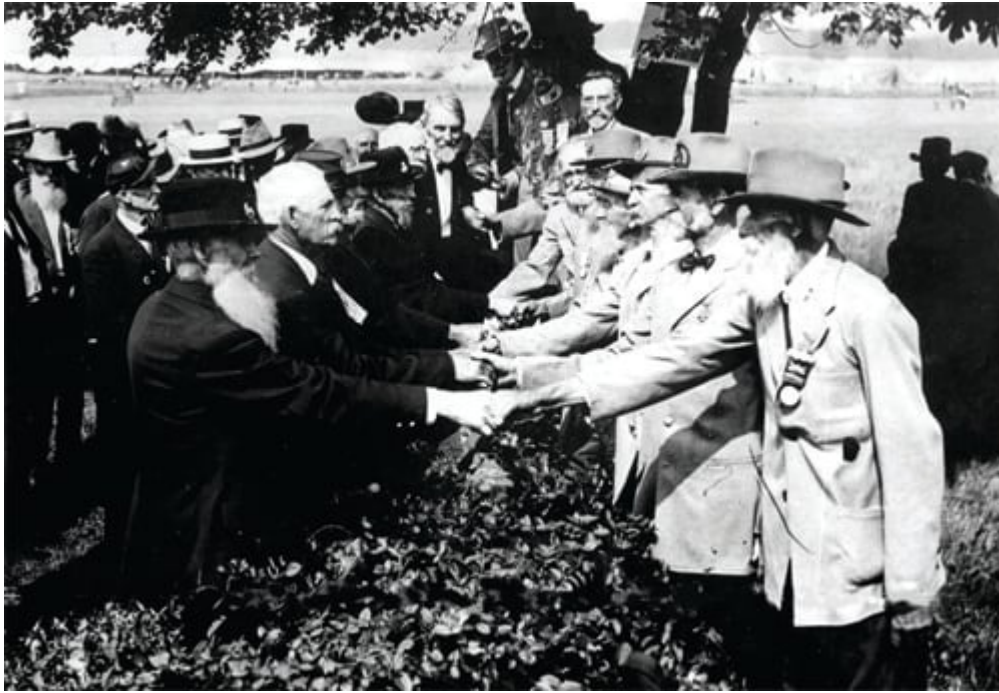
50th Anniversary, Battle of Gettysburg, Union and Confederate Veterans Greet Each Other at the Scene of Pickett's Charge, 1913

What does a nation without heroes look like?