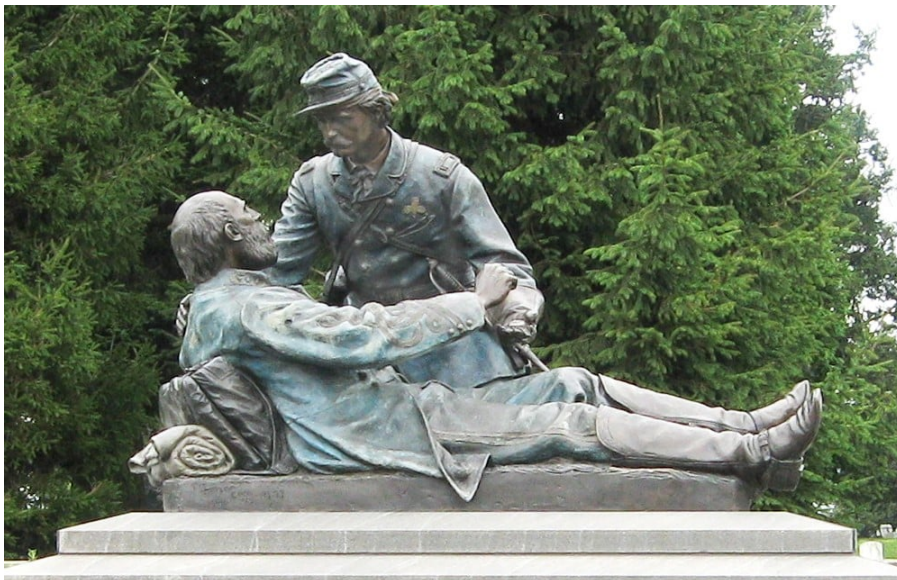
Memorial to Union officer and mortally wounded Confederate General Lewis Armistead on the field of Gettysburg.

These lessons of forgiveness and reunification are now forgotten to the detriment of all Americans living and dead and those yet born.