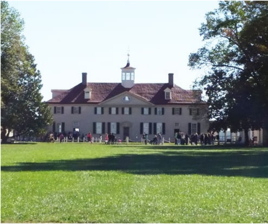
Mount Vernon (Dan Mallock)

When do we retreat from the precipice of the destruction of our foundations and admit the truth—that our forebears were not perfect and neither are we, and that our temporary status of the “living generation” does not give us the right to obliterate what we owe to the future, that is, our heritage and national story.