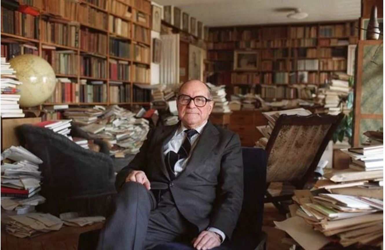
Julián Marías

There is a tendency of our times that preoccupies me a lot, and this is the tendency that consists in evading the irrevocable, in trying to conceal the radical character of human life – which is that and nothing else. –Julián Marías, Philosophy as Dramatic Theory