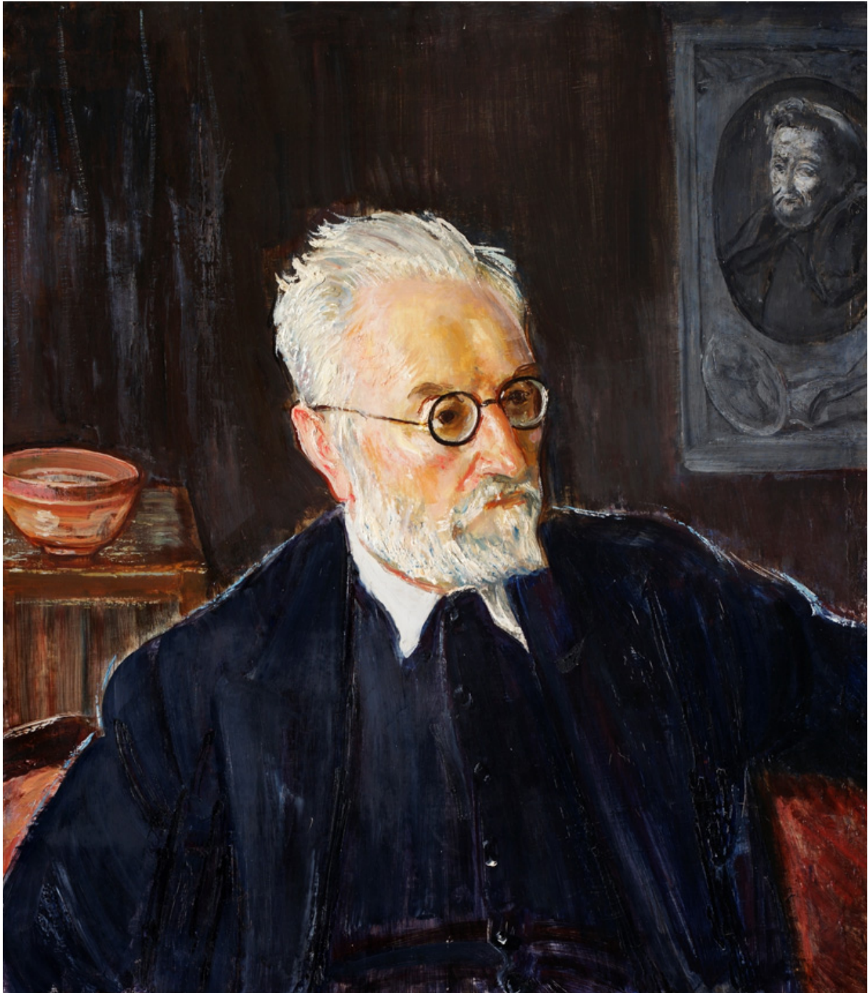
Miguel de Unamuno— Maurice Fromkes, 1925