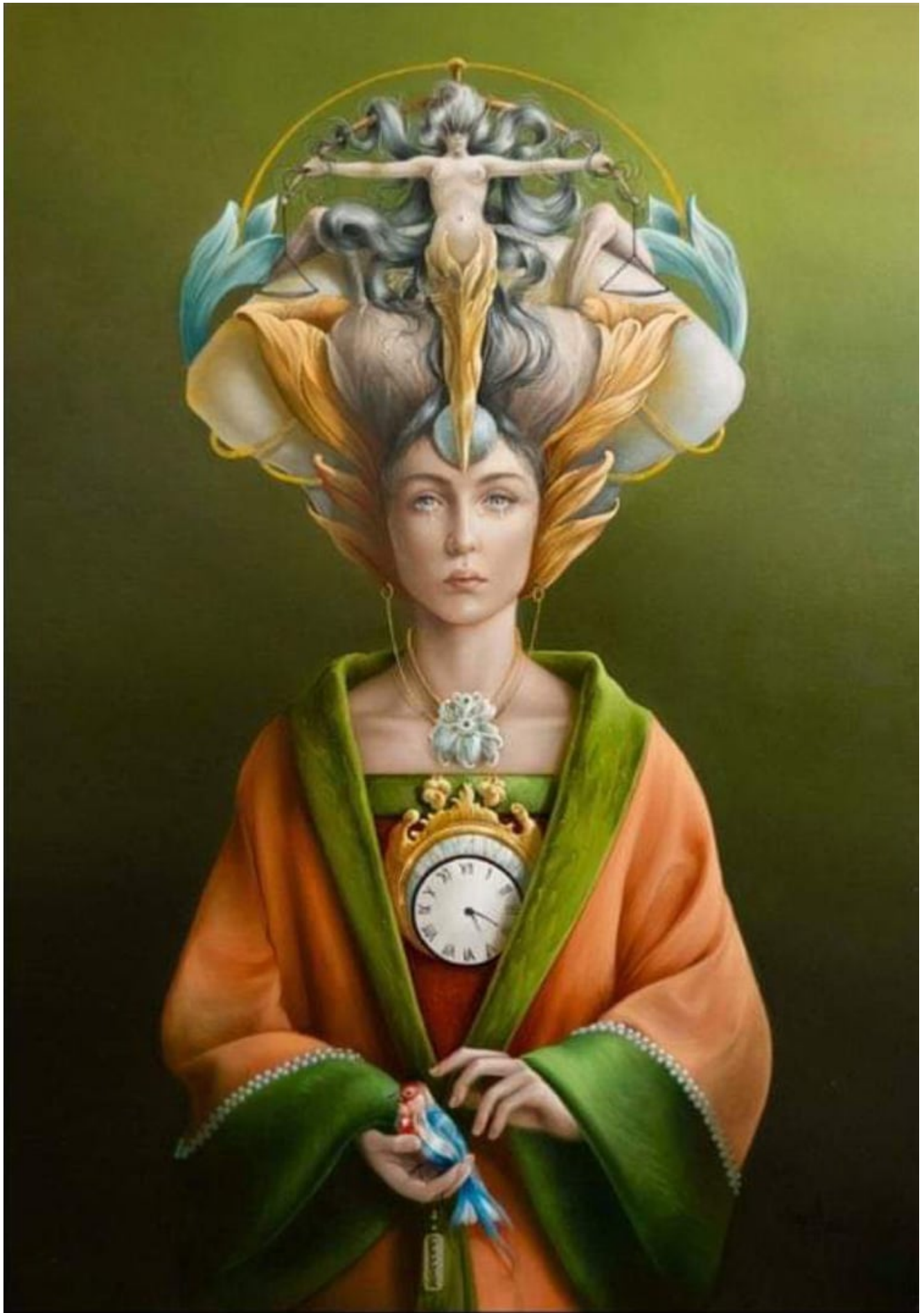
Las lamentaciones de Dike (The Lamentations of Dike), Yuri