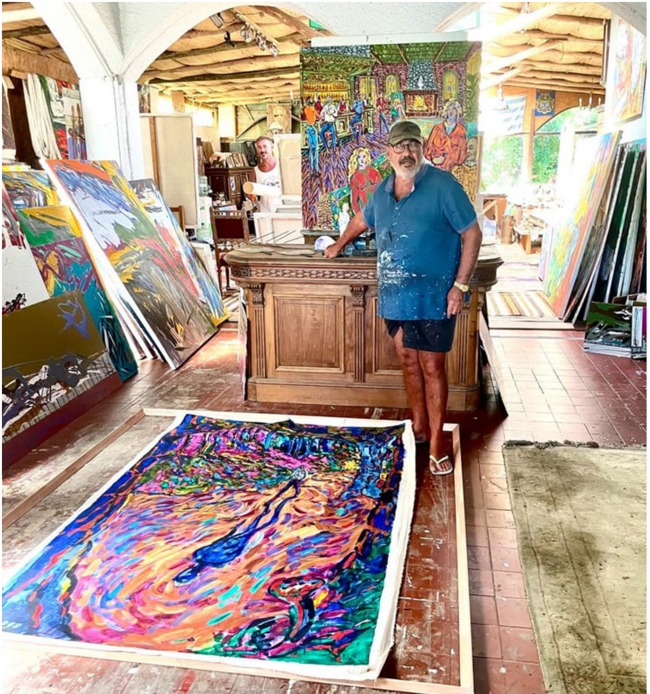
Ignacio Zuloaga standing next to his painting "Hombre perdido en un bosque (Man lost in a forest)"