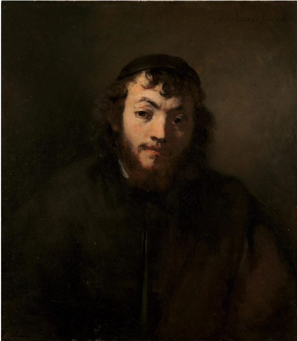
Bust of a Young Jew (Rembrandt van Rijn, 1663)

A recent biography of John Milton observed that, in the seventeenth century, if an author wanted to write a polemic,