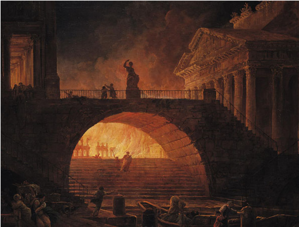
Fire of Rome, Hubert Robert, 1771

“the problems of violence and inhumanity that faced the world at the time of Christ’s birth still exist in such areas as Vietnam”