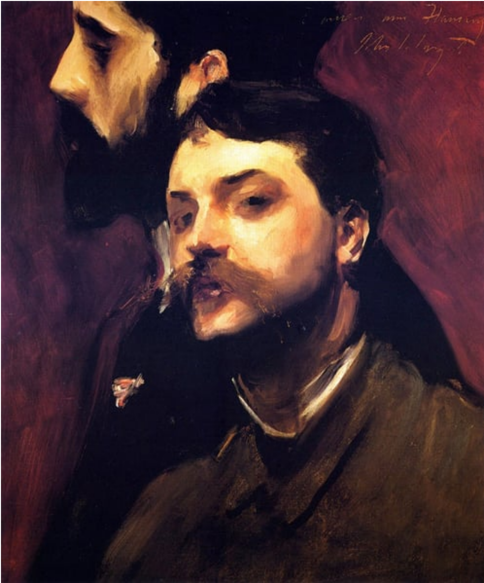
François Flameng and Paul Helleu, John Singer Sargent, 1880

For many intellectuals, diversity now serves as a powerful idol. Having sympathy for “the excluded,” or, anyway, a careerist desire to appear “moral,” they want us to believe