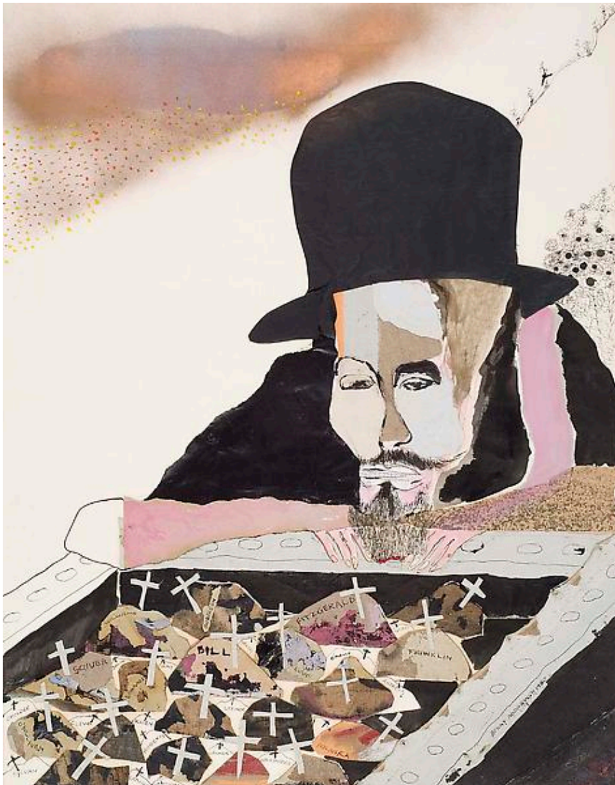
Here Comes the Wind , Benny Andrews, 1980