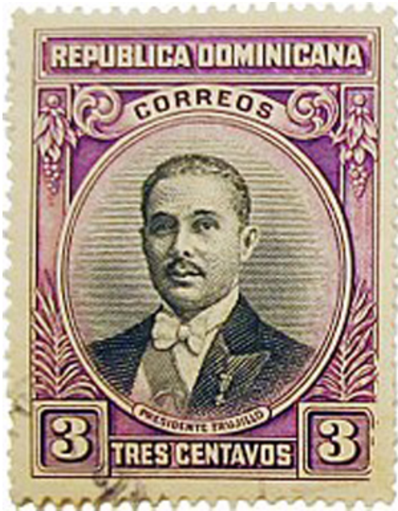
Rafael Trujillo, 1933

The barbaric killings of so many civilians including many women and children was largely unreported abroad due to the fact that the army had murdered and buried the victims en masse in isolated rural areas, leaving either no witnesses or just a few survivors. The extraordinary violence of that unfortunate episode was not an isolated incident and anti-Haitianism has continued to grow over the last sixty years until the present. Most Latin American governments have preferred to keep this issue untouched, much like the Inquisition, as it reflects badly on the shared proud heritage of Hispanidad and "La Raza."