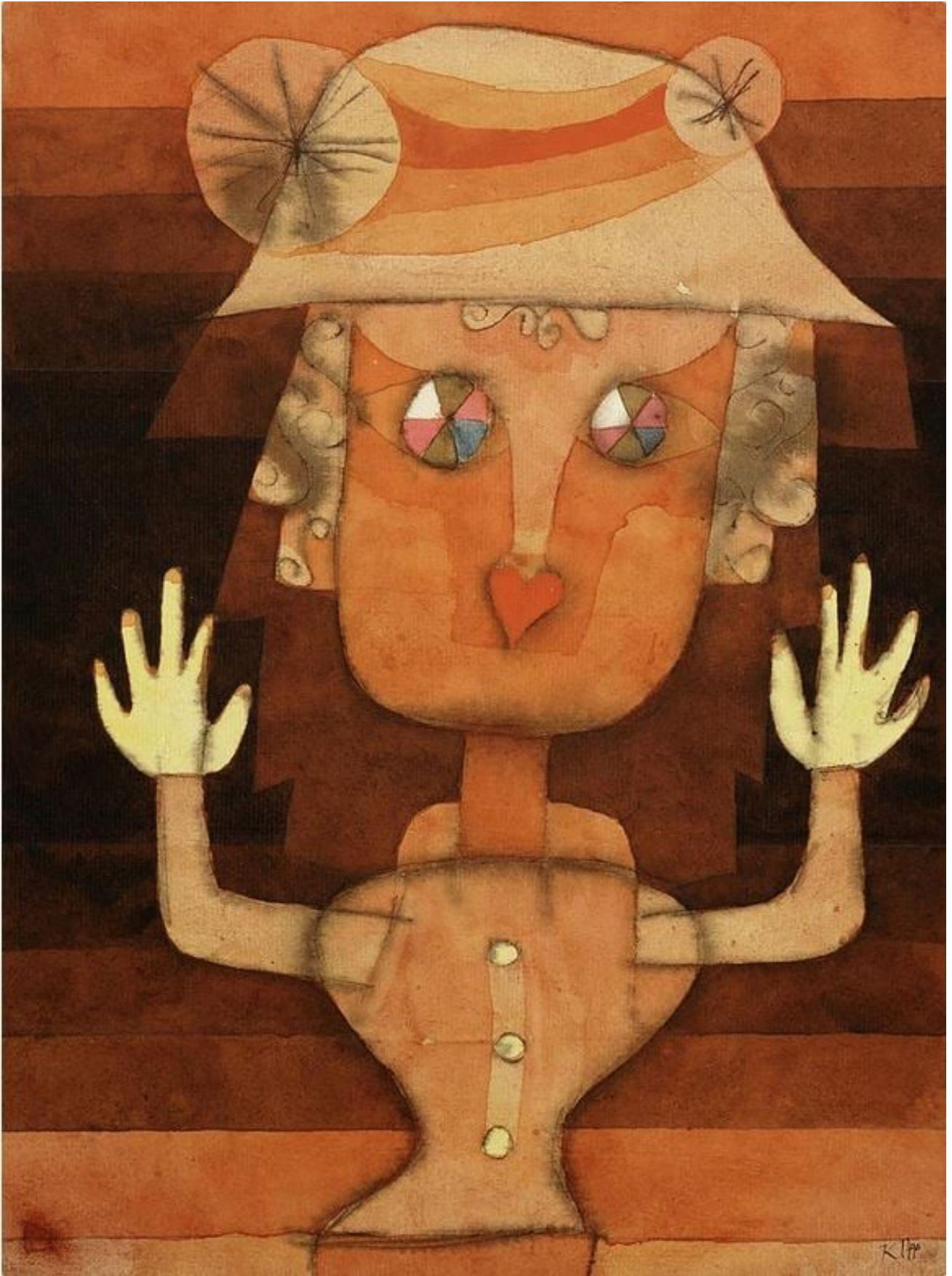
Doll/Puppet , Paul Klee, 1923