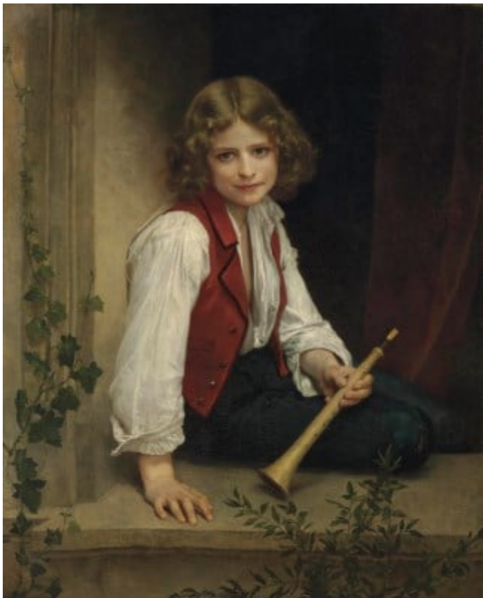
Pifferaro , William-Adolphe Bouguereau

For this, for this, the Bucolic stance Was once confected as the response.