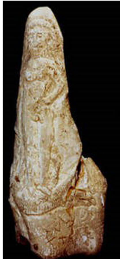
Hermaphroditic Figure, Glozel and "The Hunter" (or "The Shaman"), Glozel [20]

Ever since it was discovered in 1924, Glozel has been a site of contention, and thus stands as point of disagreement over many matters, not only the usual scientific arguments over date, function, and place in prehistorical paradigms. [21] In particular, opponents who call the site a fraud and the objects found there forgeries and falsifications point to the varying dates assigned to the things found and the different parts of the site, the mixture of styles, materials and techniques used to carve, shape and model the assemblage, and almost go apoplectic at the kinds of scratches, lines and proto-alphabetic signs often inscribed on stone, bone and clay objects. [22] It was also alleged that the figures of hermaphrodites were patently false because they are unknown in any other prehistoric digs. "Dans le monde, on a trouvé aucun objet qui ressemble aux idoles bisexuelles de Glozel." (In the whole world no one has ever found anything like these bisexual idols of Glozel.) M. Sabète, in her study of "Mythes