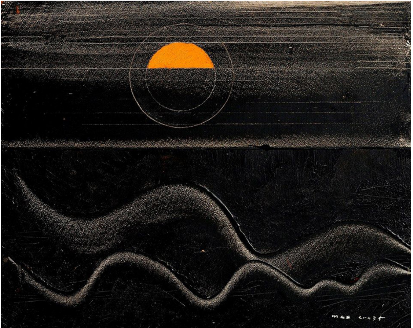
La Mer et le Soleil , Max Ernst, 1926

The 1968 classic movie Rosemary's Baby , directed by Roman Polanski and based on a bestselling novel by Ira Levin, is worth reflecting on today amidst the pandemic climate of fearmongering and dark forces in the world. The film version of the book is a masterpiece in conspiracy and the ostensible