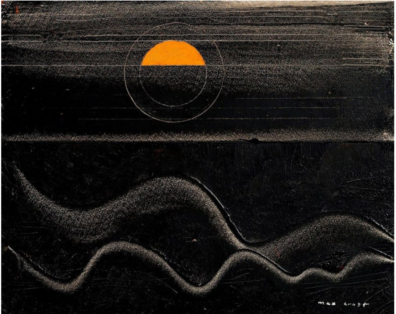
La Mer et le Soleil , Max Ernst, 1926

The 1968 classic movie Rosemary's Baby , directed by Roman Polanski and based on a bestselling novel by Ira Levin, is worth reflecting on today amidst the pandemic climate of fearmongering and dark forces in the world. The film version of the book is a masterpiece in conspiracy and the ostensible