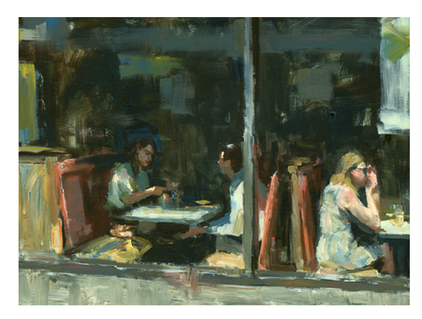
Two People #4, Darren Thompson, 2012