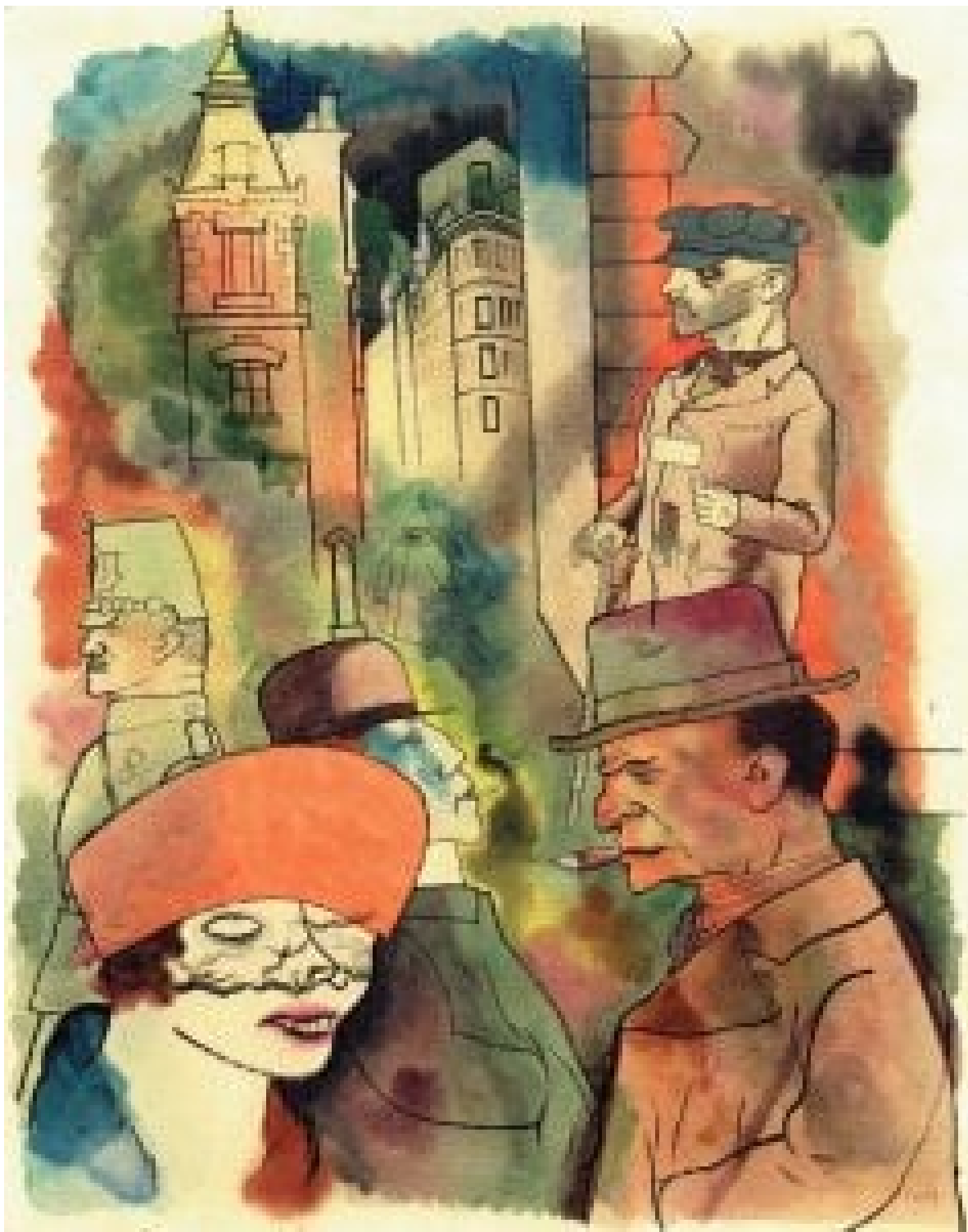
Dämmerung (from Ecce Homo ), George Grosz, 1922

Trannies need us to play along or the entire illusion