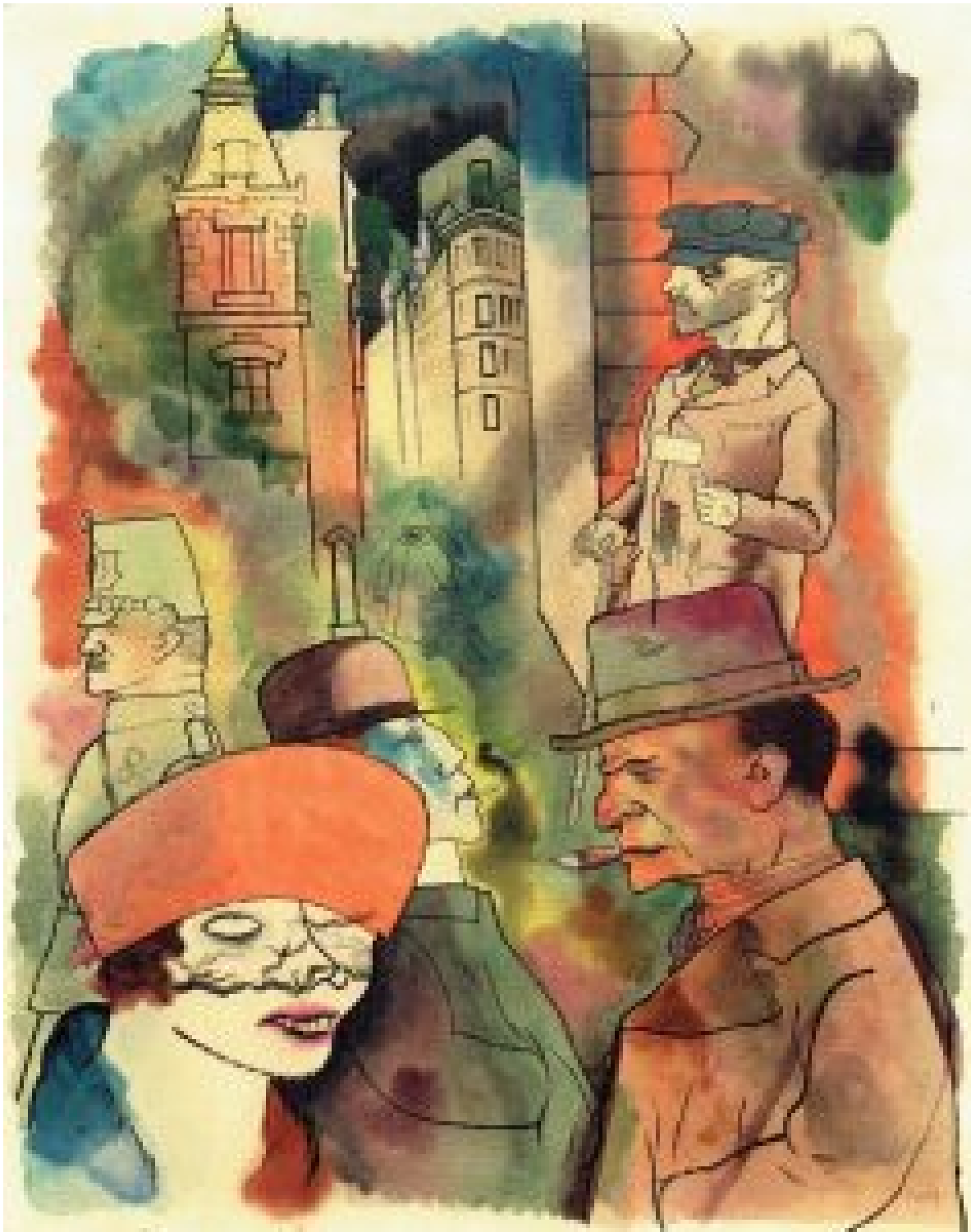
Dämmerung (from Ecce Homo ), George Grosz, 1922

Trannies need us to play along or the entire illusion