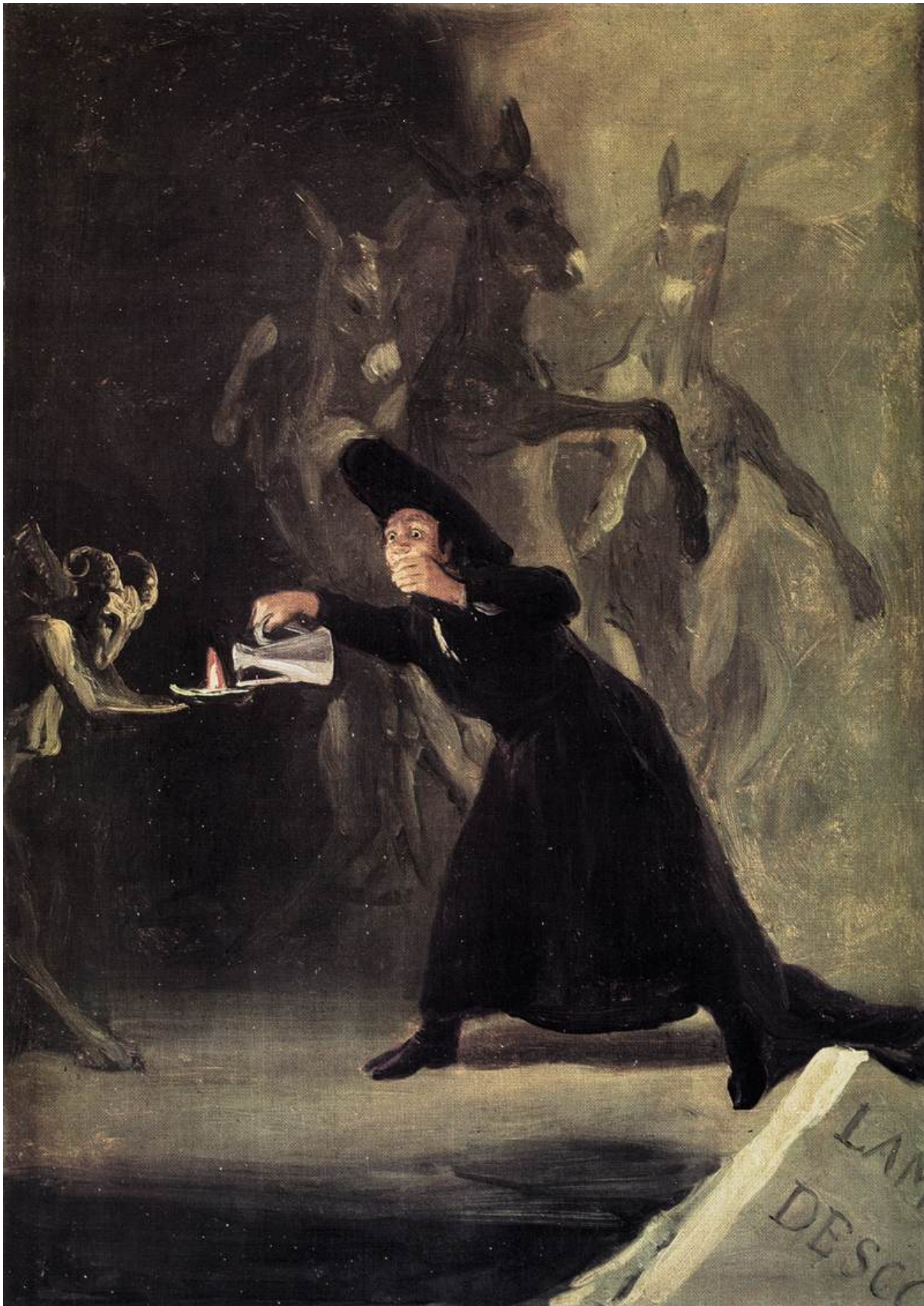
The Bewitched Man , Francisco de Goya, 1798