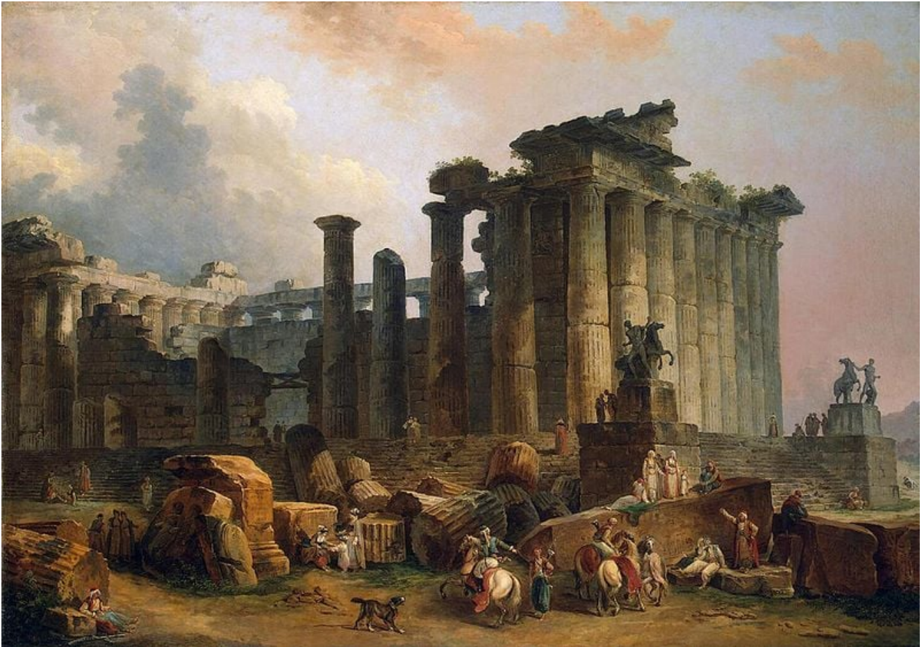
Ruins of a Doric Temple, Hubert Robert (1783)

That something is rotten not in the state of Denmark, but in that of the whole of the western world, has become almost a truism. Even countries that were previously contented to the point of complacency, such as Sweden, now suffer from severe angst. Under no external compulsion or moral obligation to do so, the latter created an insoluble problem for itself by allowing, or even encouraging, an alien population to settle in it. If reports are to be believed, there are now 'no-go' areas in some Swedish cities, unthinkable before, and areas to