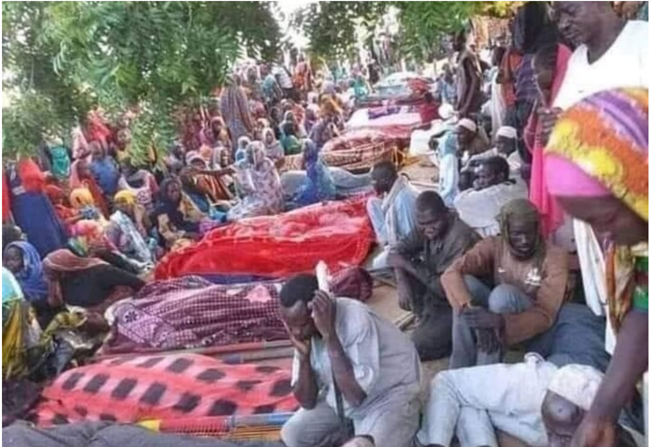
Victims of the RSF/Janjaweed Massacre Krindang IDP Camp El Geneina, December 29, 2019