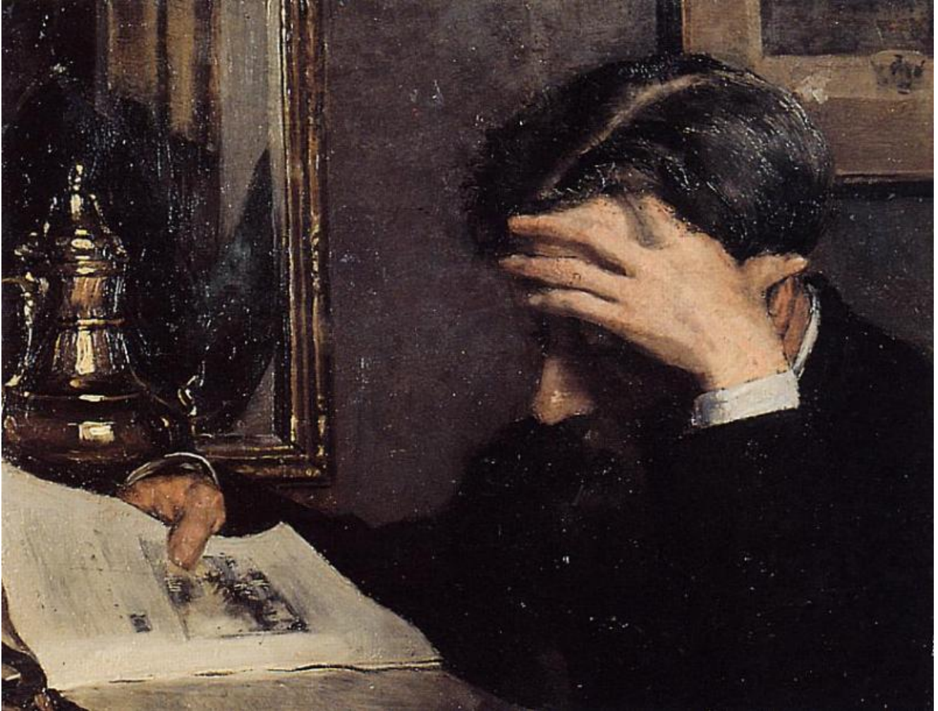
Man Reading , Georges Lemmen, 1883

Mrs Thatcher relaxed with thrillers. 'At the moment I'm re-reading The Fourth Protocol ,' she told an interviewer in 1985. Frederick Forsyth is an exceptionally gifted and successful writer. But 're-reading' suggests a deeper reason for the book's appeal to her. She was fascinated with its rivetingly authentic detail and its interface between high politics and intelligence activity. The novel bears upon her own career.