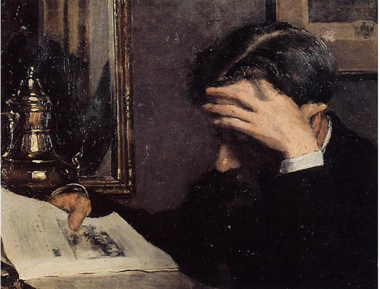
Man Reading , Georges Lemmen, 1883

Mrs Thatcher relaxed with thrillers. 'At the moment I'm re-reading The Fourth Protocol ,' she told an interviewer in 1985. Frederick Forsyth is an exceptionally gifted and successful writer. But 're-reading' suggests a deeper reason for the book's appeal to her. She was fascinated with its rivetingly authentic detail and its interface between high politics and intelligence activity. The novel bears upon her own career.